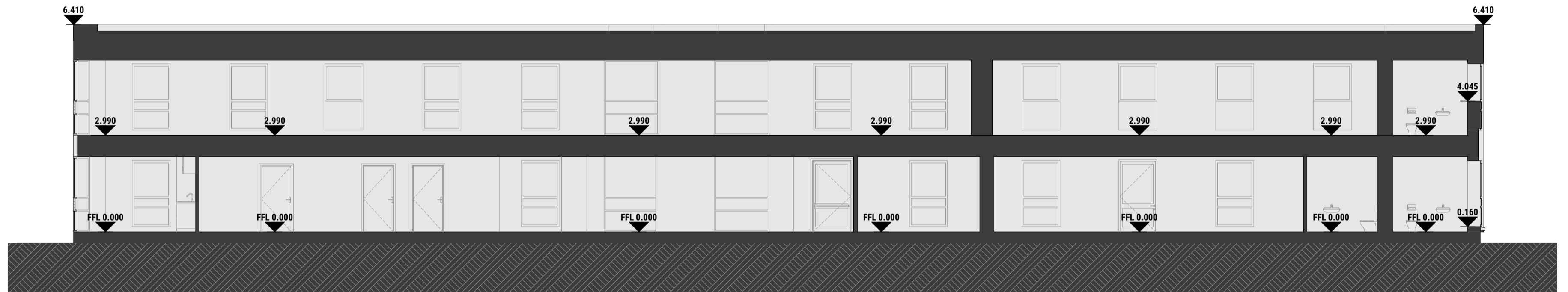
EXISTING SECTION E-E SCALE 1:100