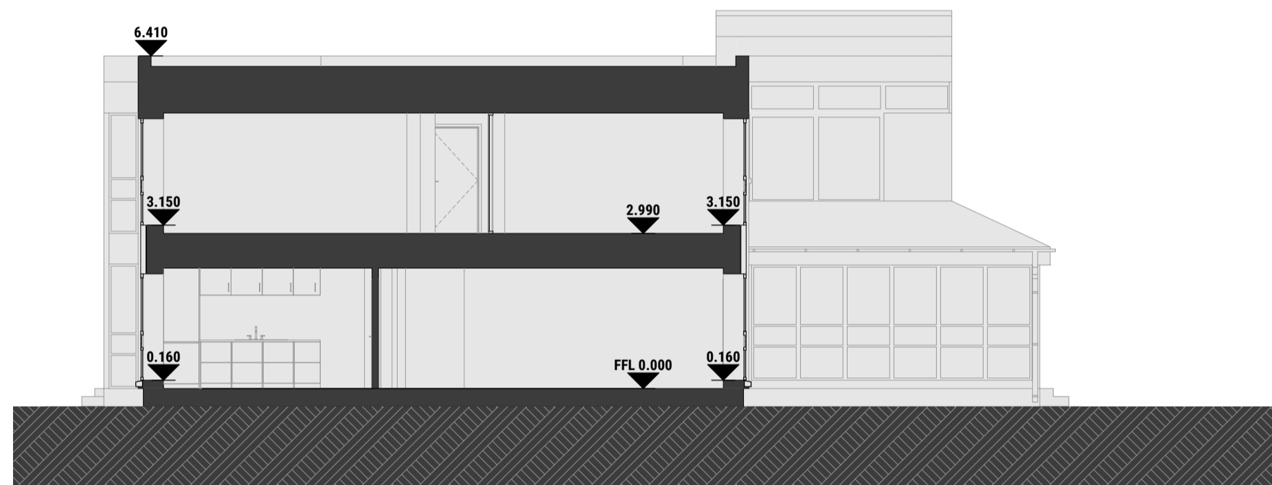
EXISTING SECTION B-B SCALE 1:100