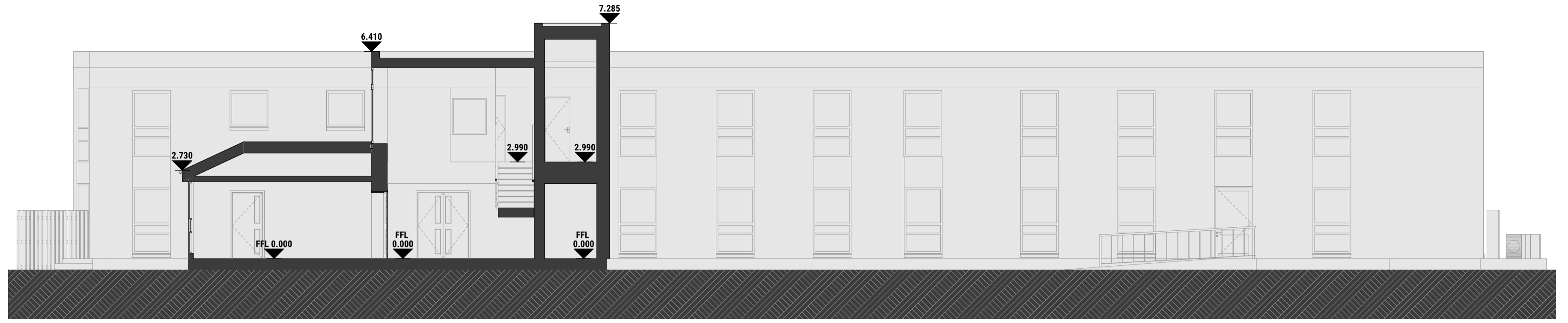
EXISTING SECTION D-D SCALE 1:100