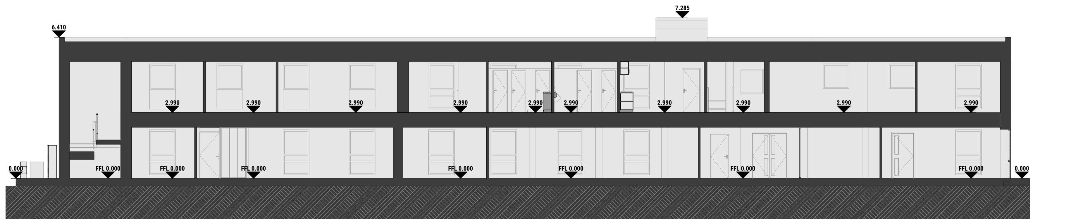
EXISTING SECTION F-F SCALE 1:100