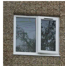
White uPVC Windows