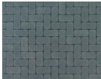
Tobermore Hydropave Permeable Paving Slabs