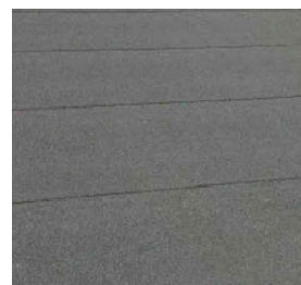
Flat Roofing Felt