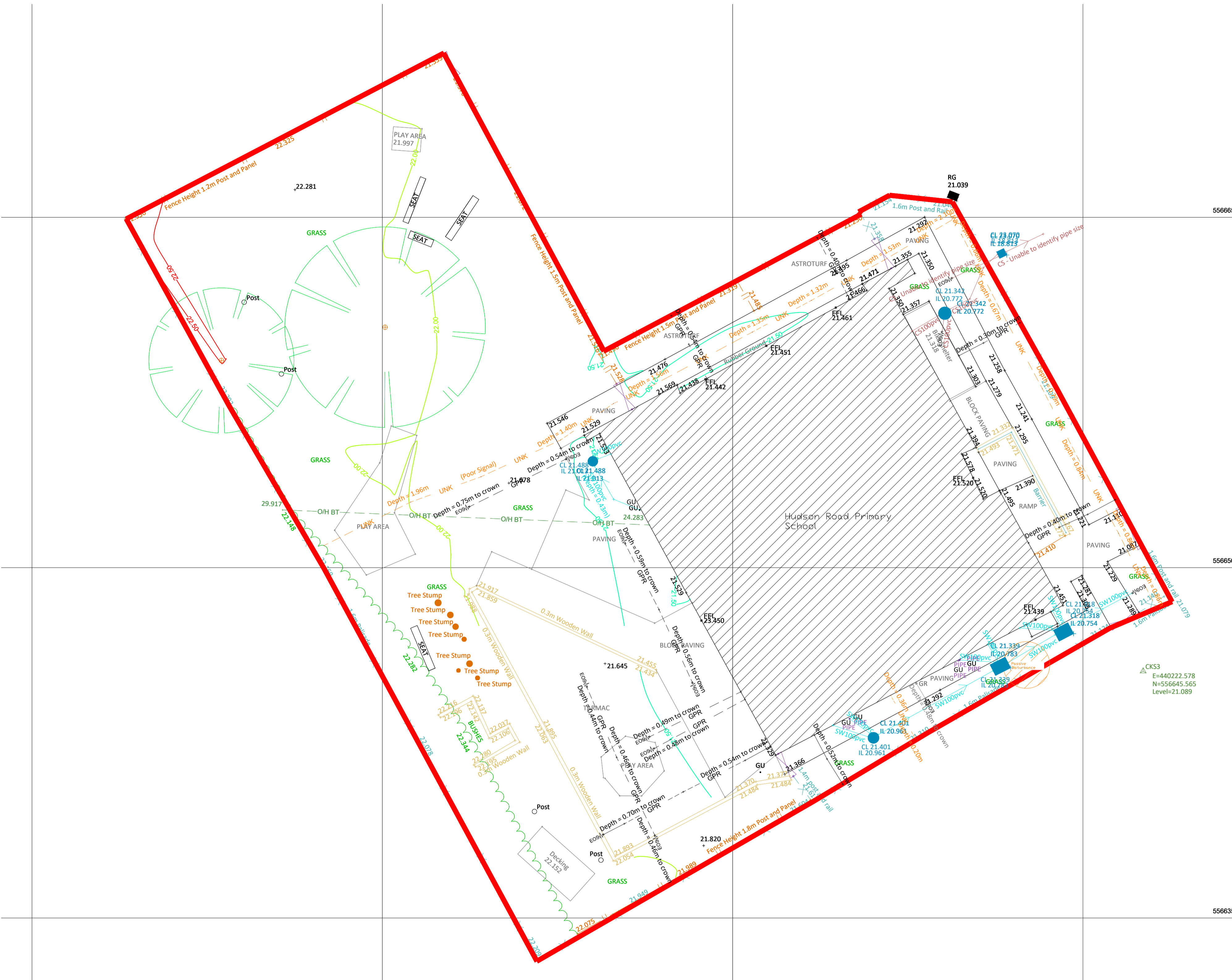
EXISTING SITE LAYOUT SCALE 1:100