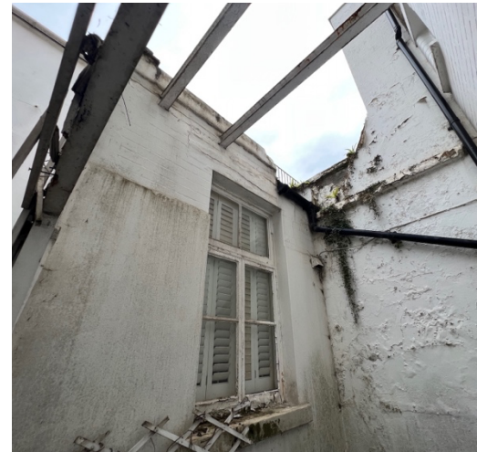
Rear extension and garden boundary wall