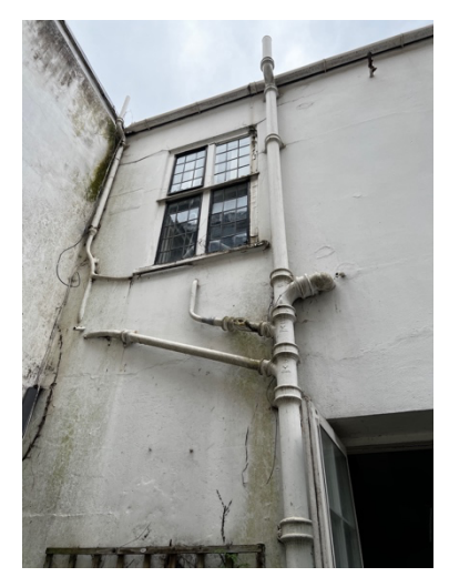
Current condition of the existing building

The proposed basement is underground and will not affect the character of the area. The proposed light well is discreet and would be hidden from views that overlook the rear yard due to it being positioned very enclosed. The new external walls of the lightwell will be finished with painted stucco render to match the existing.