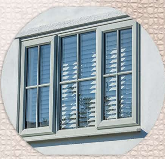
UPVC WINDOW Agate Grey (RAL 7038)