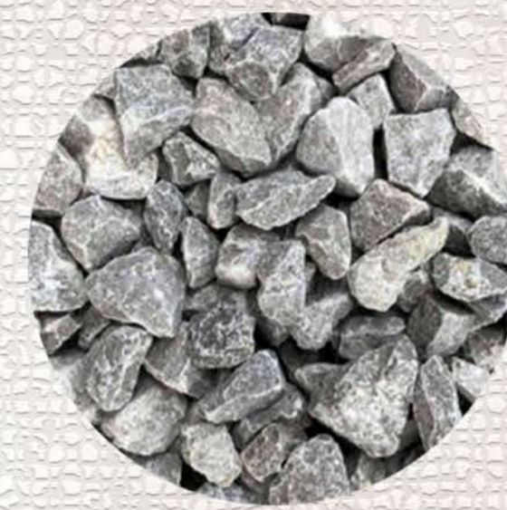
20mm GREY GRAVEL