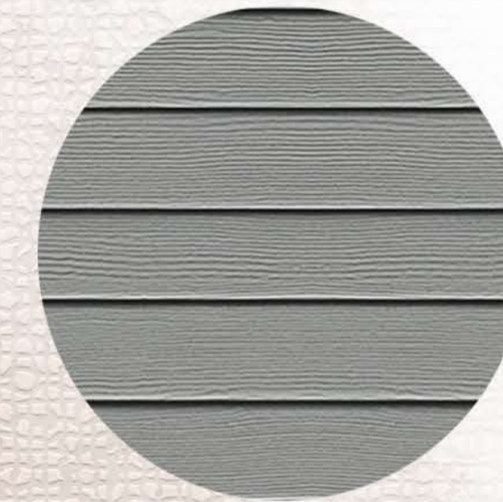
HORIZONTAL CLADDING Agate Grey (RAL 7038)