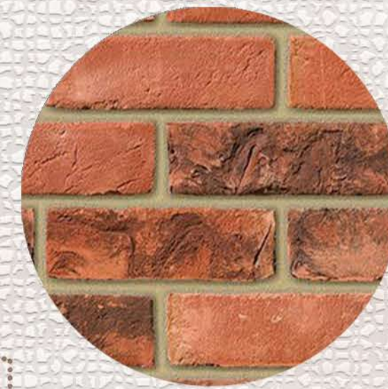
TBS BIRKDALE BLEND BRICKS