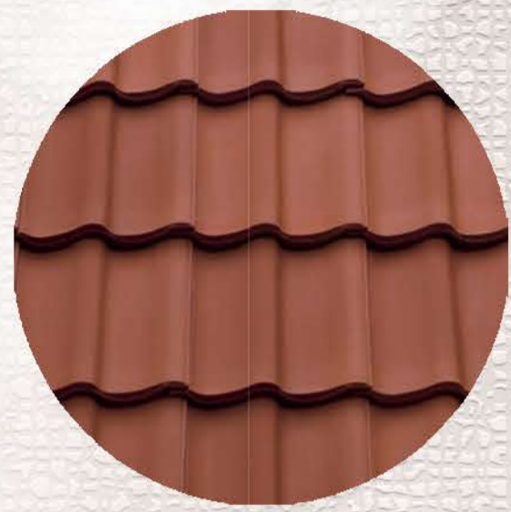
SANDTOFT OLYMPUS ROOF TILES