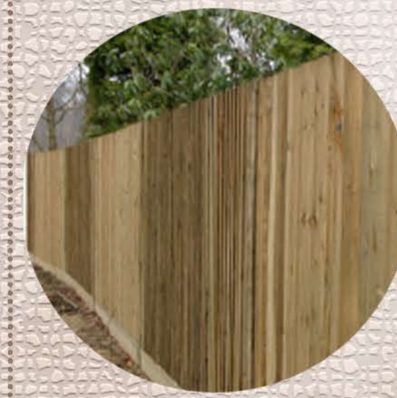
CLOSE BOARD FENCE (1.8m Fence on the rear of all the properties)