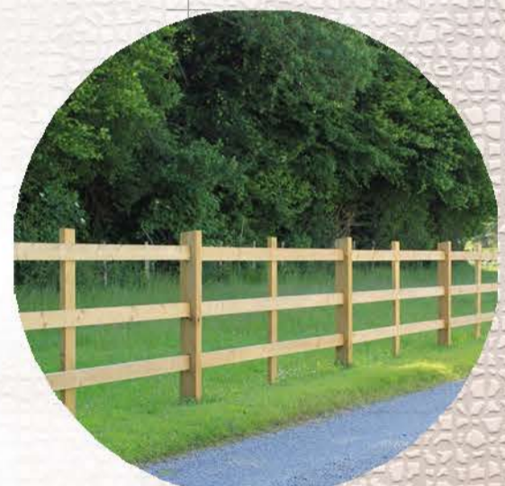
COUNTRY SIDE FENCING