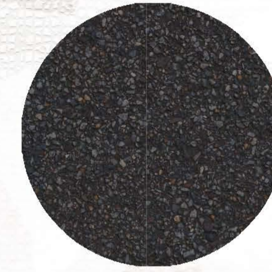
TARMAC - PRIVATE ACCESS