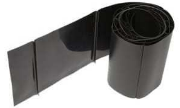
Example above of a Root Barrier from GreenBlue Urban 2022 ©. Other manufactures are available.