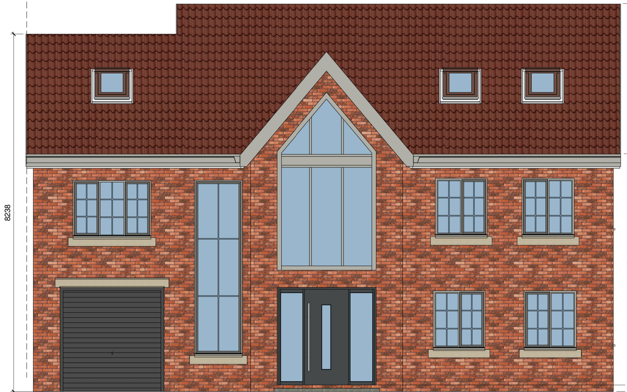
PLOT 8 & 9 - FRONT ELEVATION 1 : 50