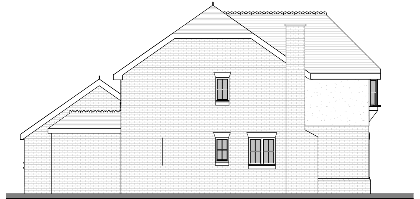
Side 1 Elevation