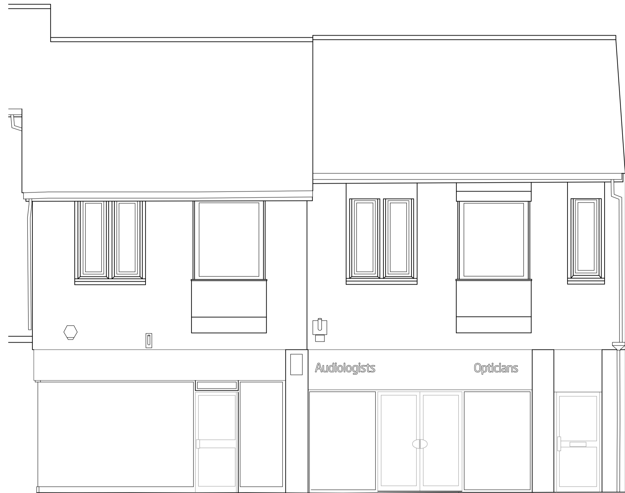
EXISTING FRONT ELEVATION - SCALE 1:50 @ A1