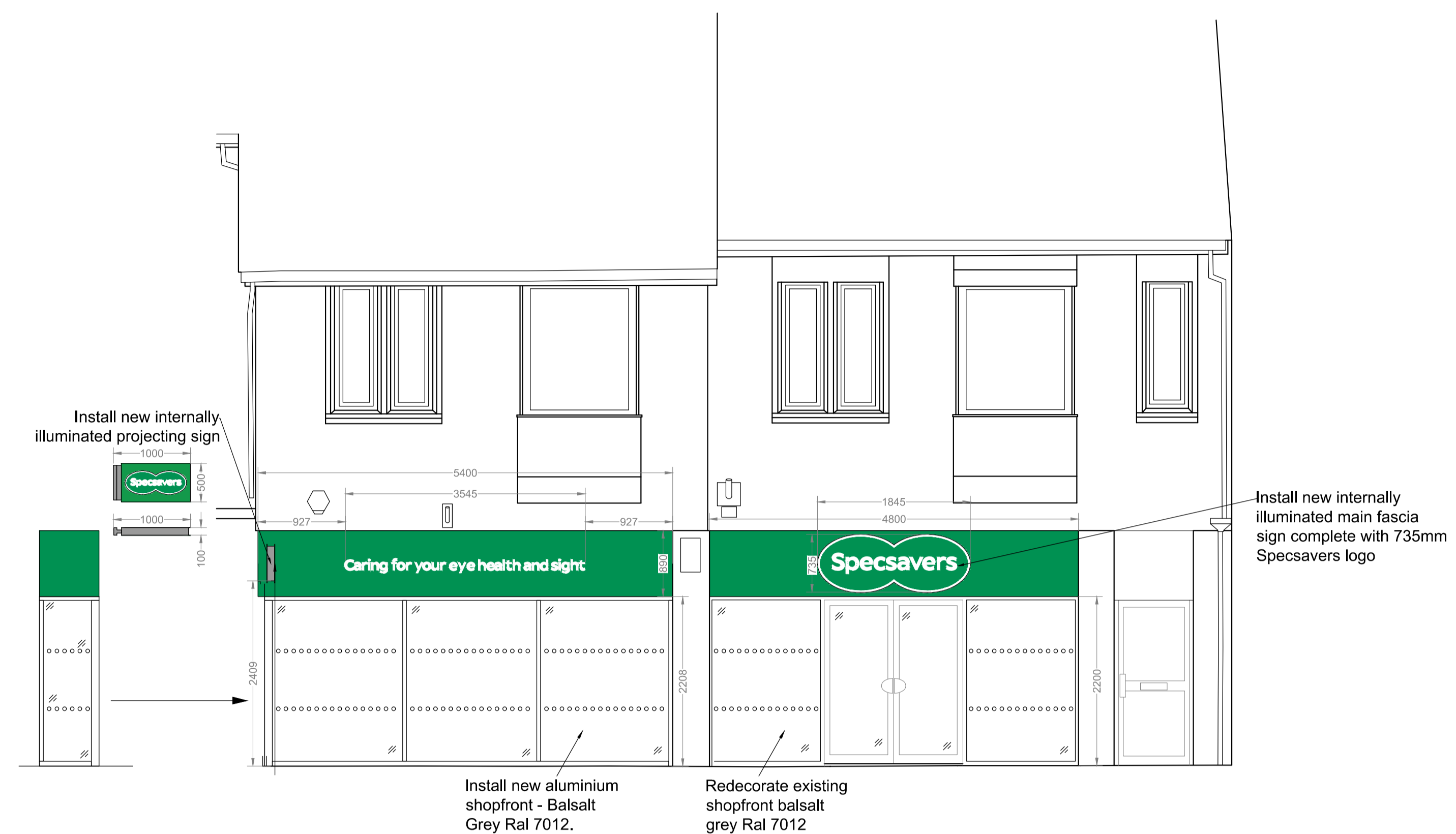
PROPOSED ELEVATION SCALE 1:50 @ A1