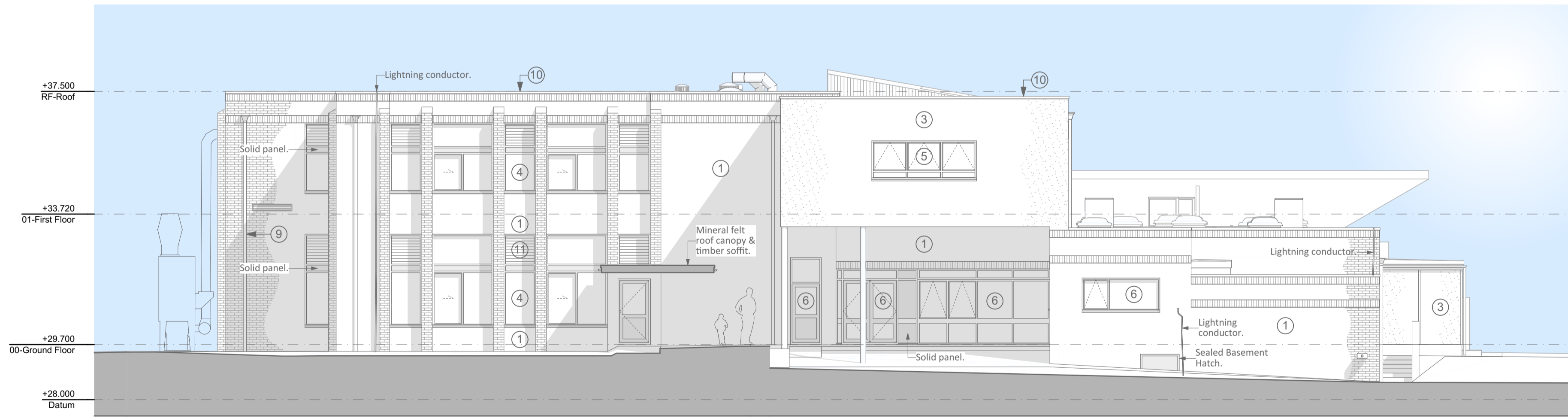
EX-03 Existing East Elevation 1:100