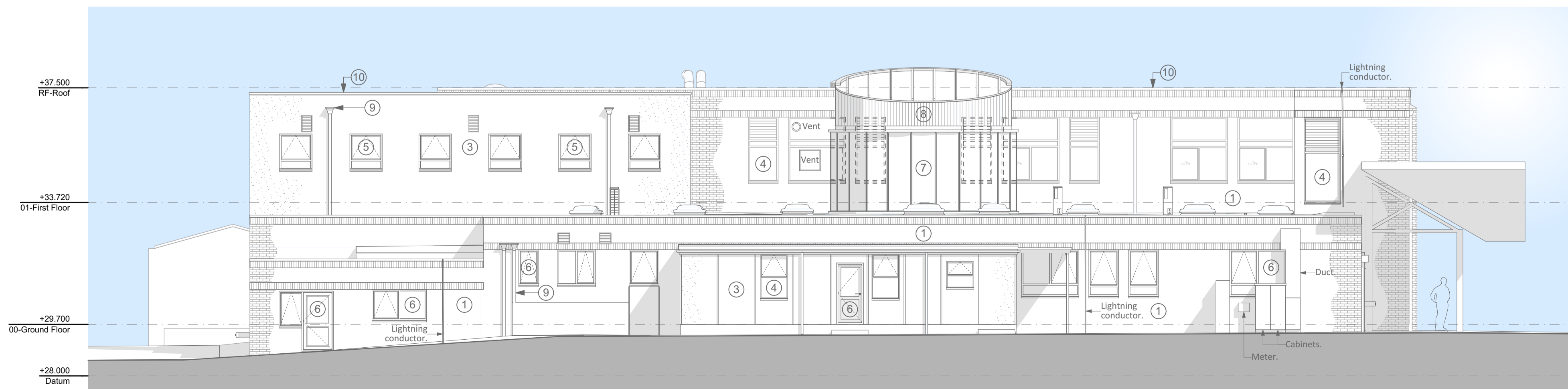
EX-05 Existing North Elevation 1:100