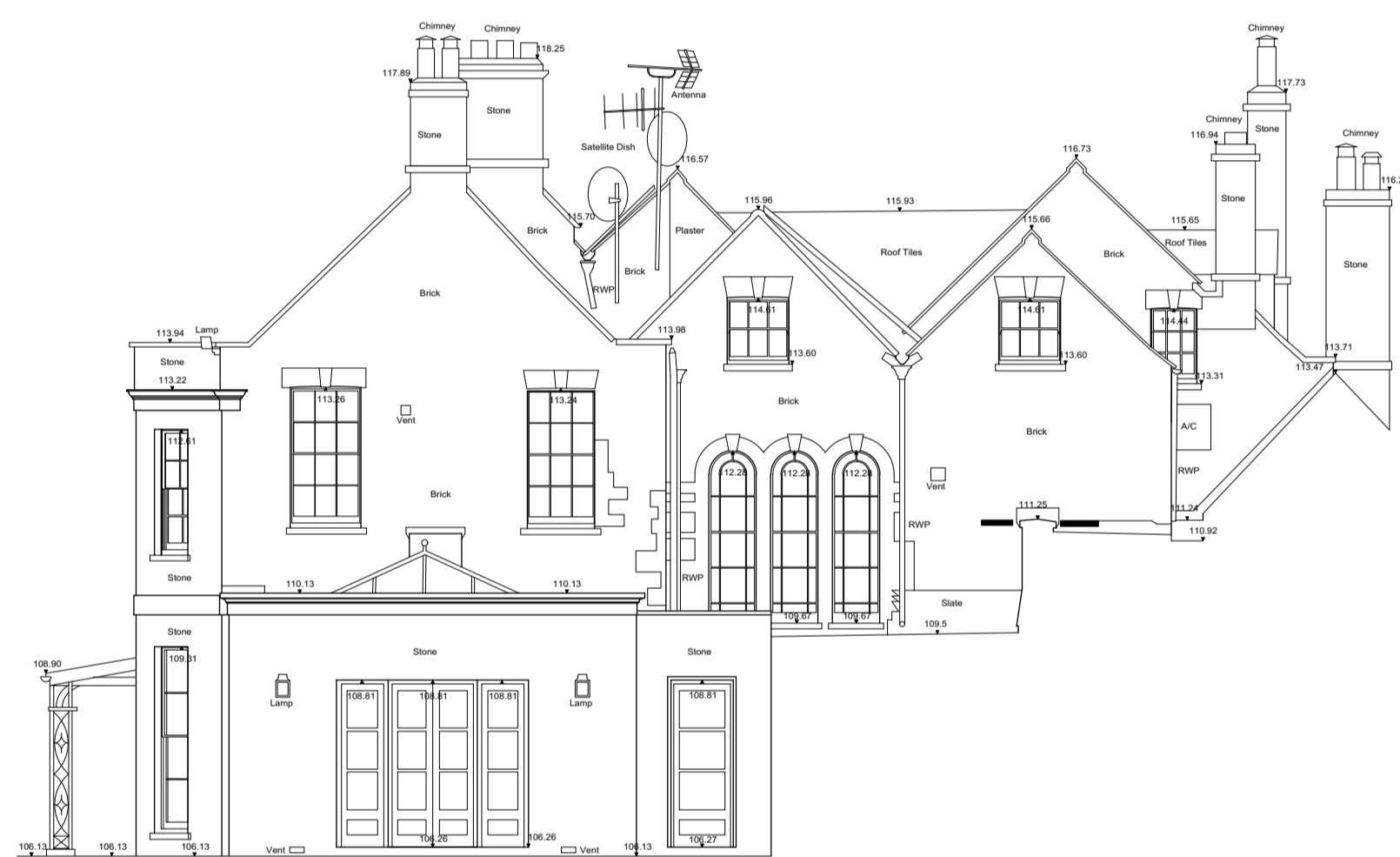
1 Existing Elevation 3 Scale: 1:100