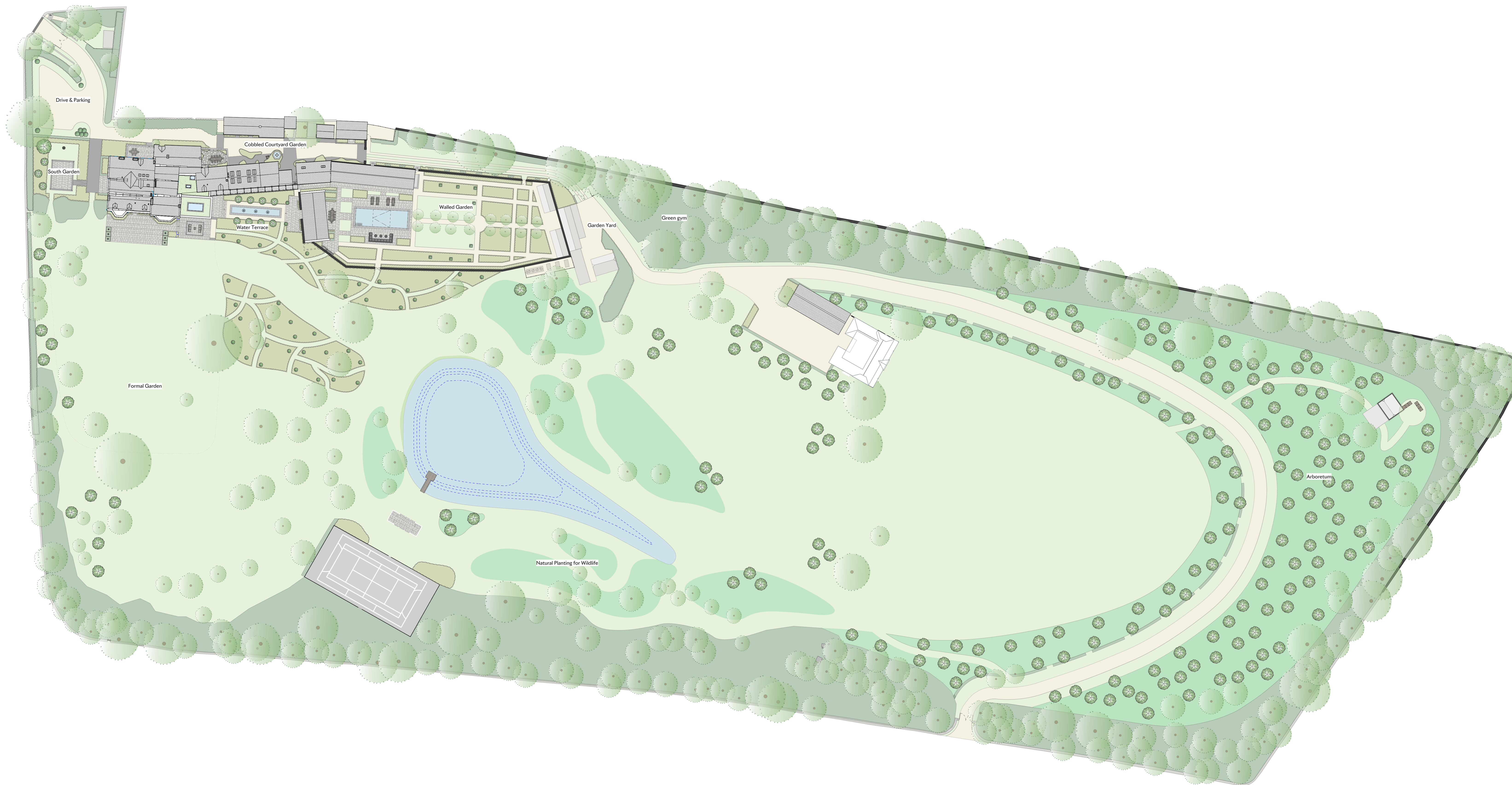
1 Proposed Site Plan Scale: 1:500