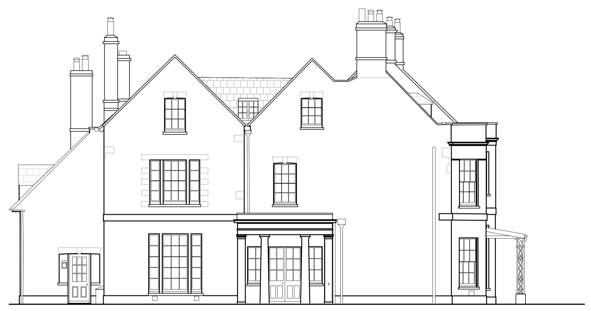
2 Proposed Elevation 2 Scale: 1:100