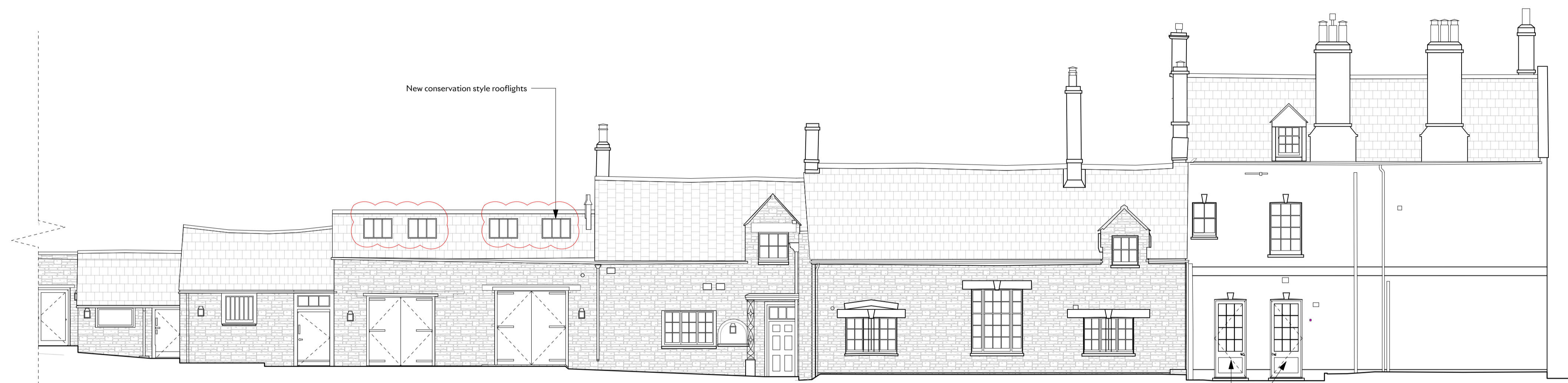
1 Proposed Elevation 1 Scale: 1:100