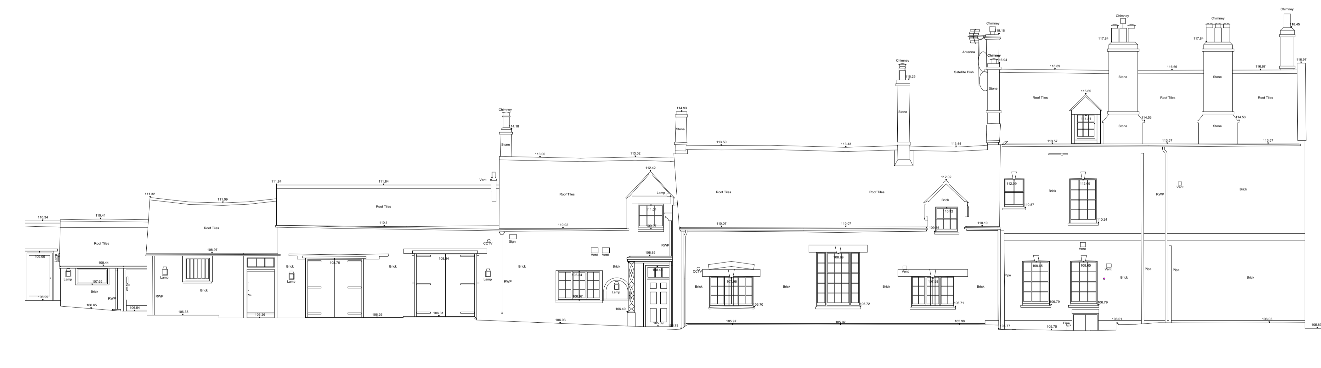
2 Existing Elevation 2 Scale: 1:100