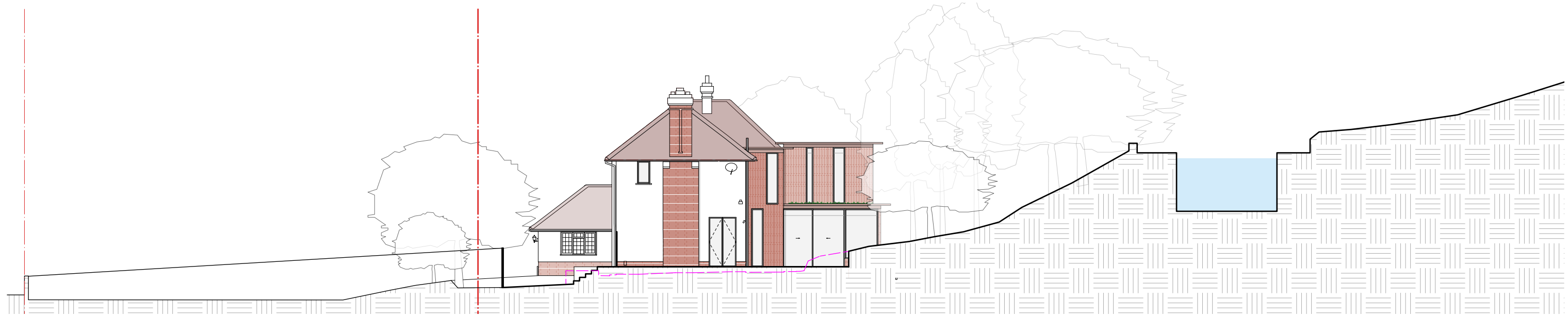
02 Side (South) Elevation Scale: 1:100 @ A3