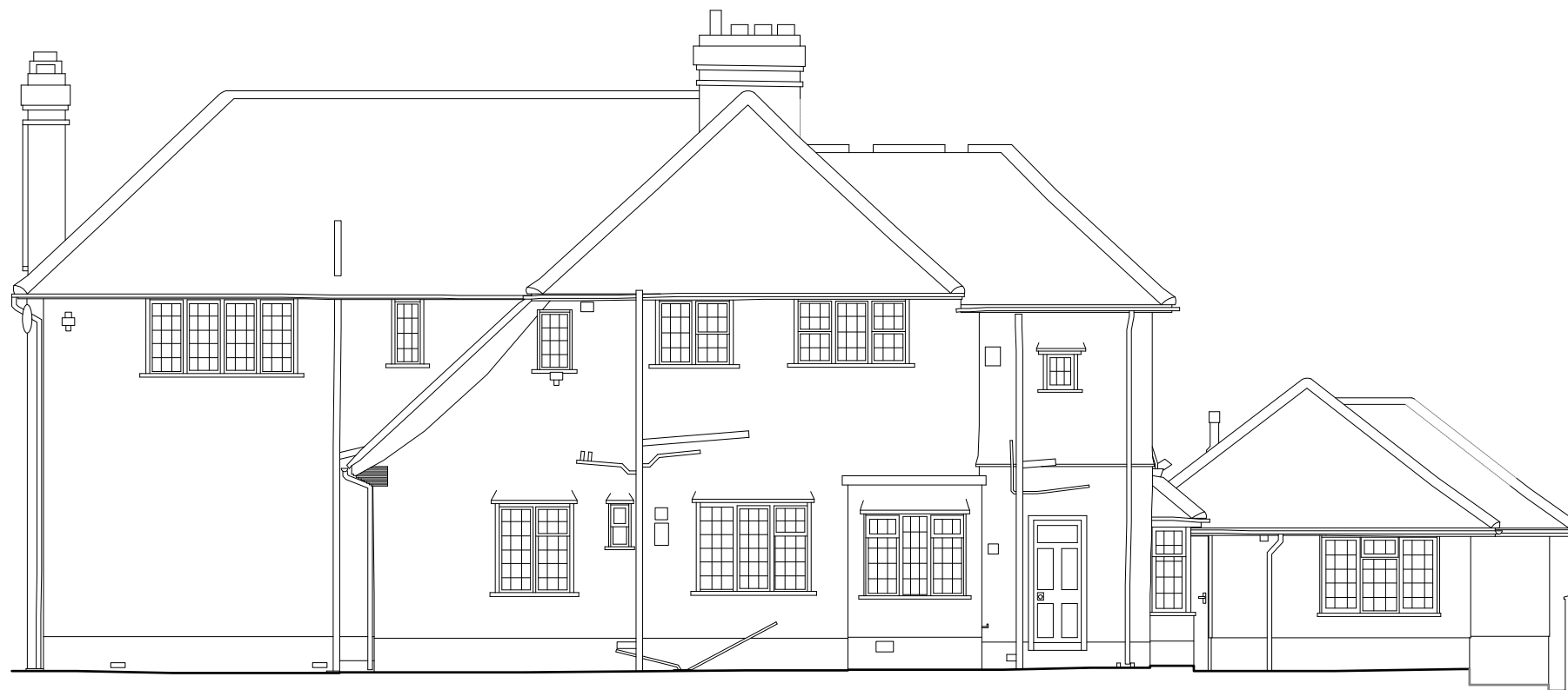
02 Rear Elevation Scale: 1:100 @ A3