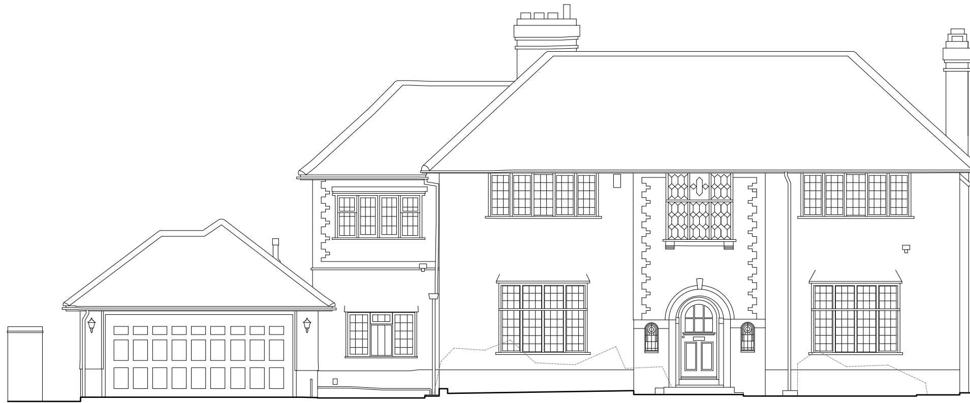
01 Front Elevation Scale: 1:100 @ A3