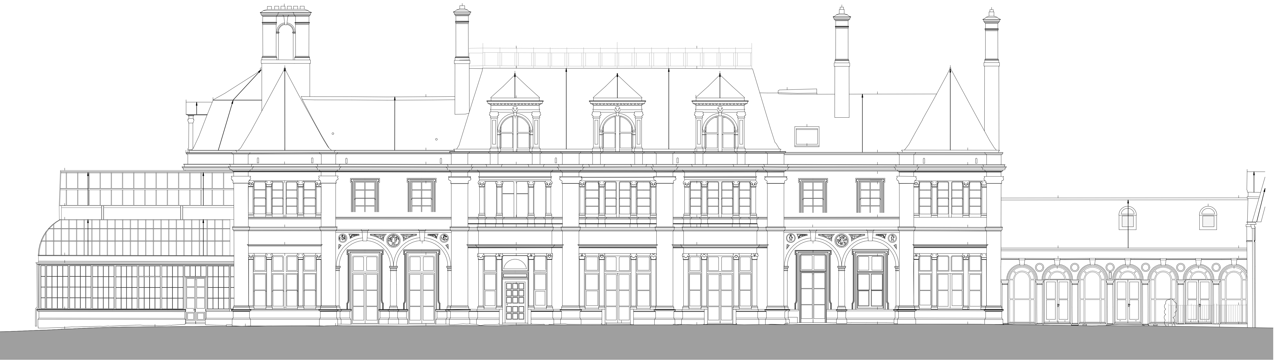
E04 - SOUTH EAST ELEVATION