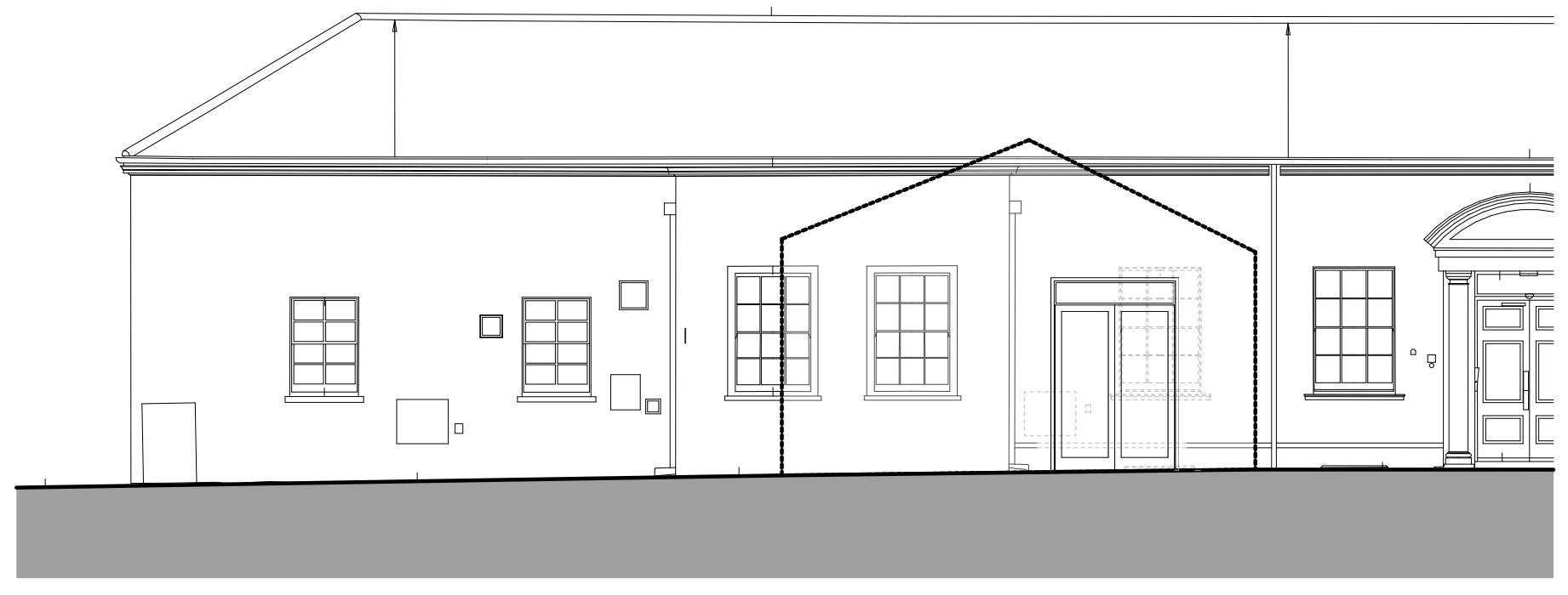
E05 - EXISTING NORTH WEST ELEVATION