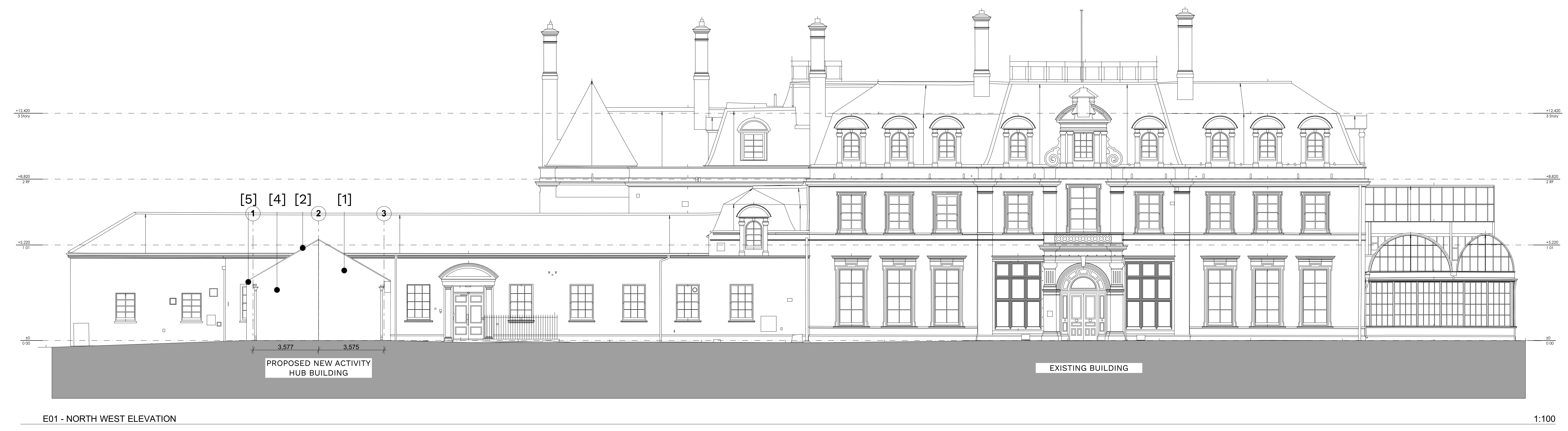
E01 - NORTH WEST ELEVATION