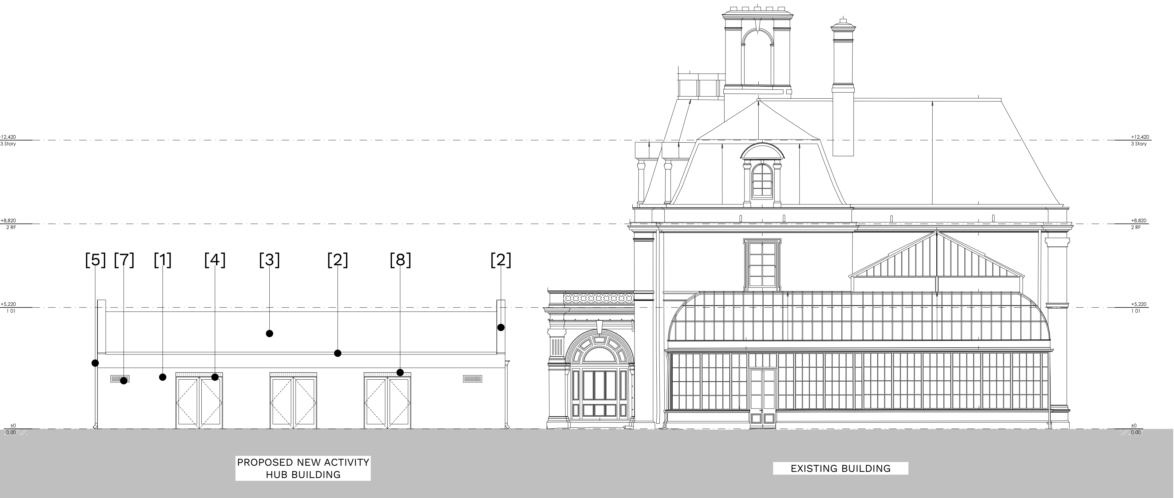
E02 - SOUTH WEST ELEVATION