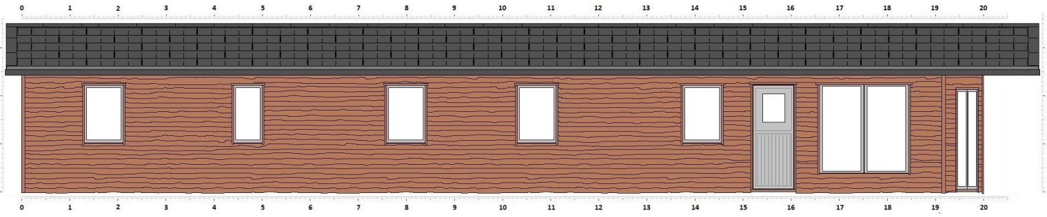
Indicative Right Hand Elevation