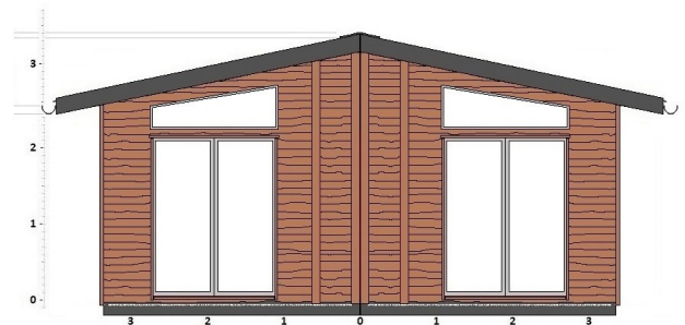
Indicative Front Elevation