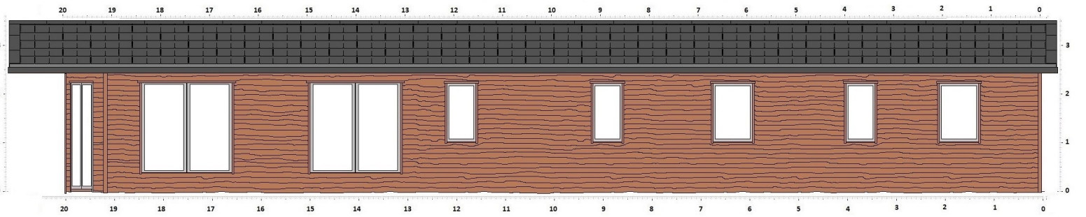
Indicative Left Hand Elevation