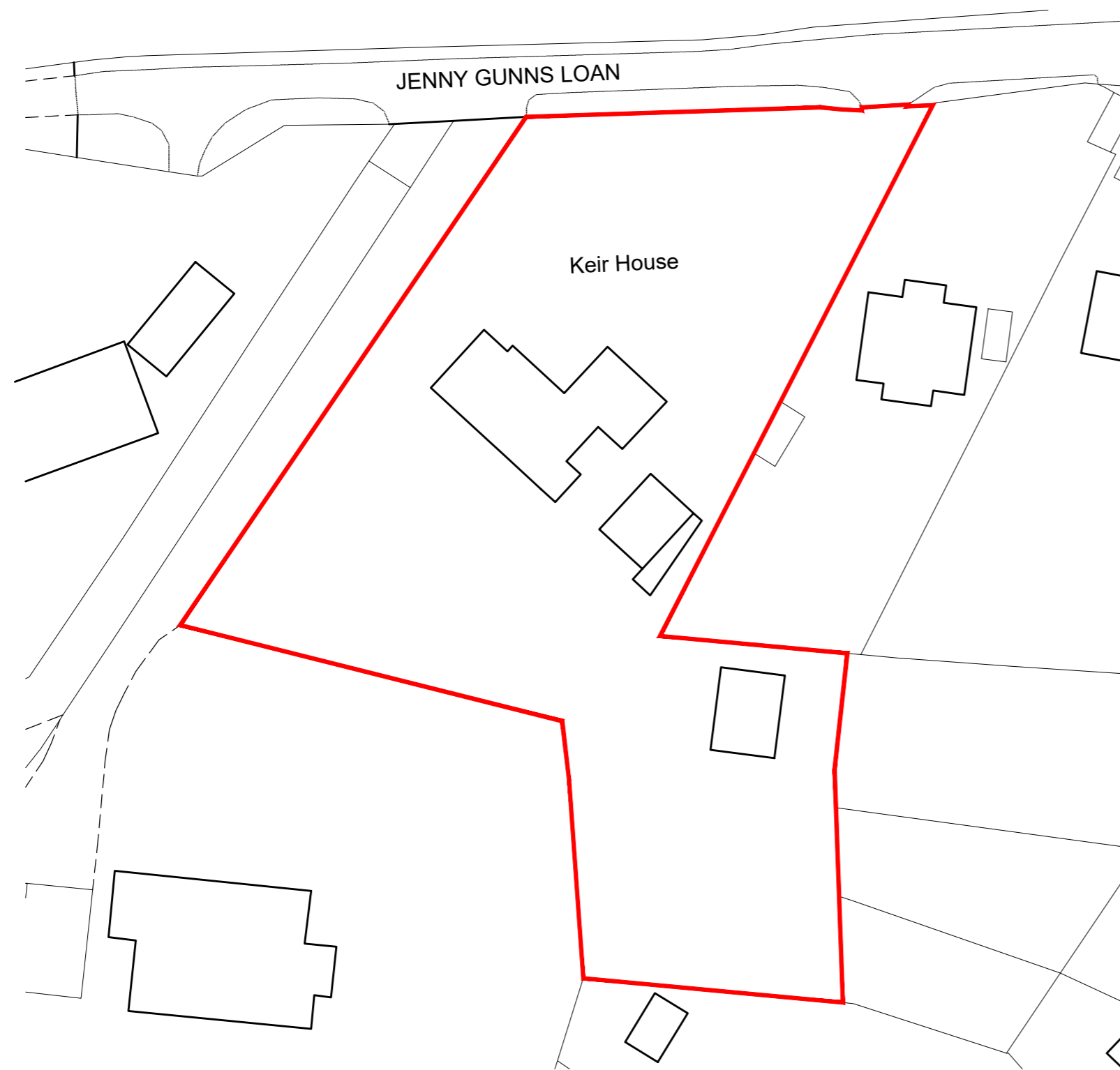
SITE PLAN AS EXISTING 1:500