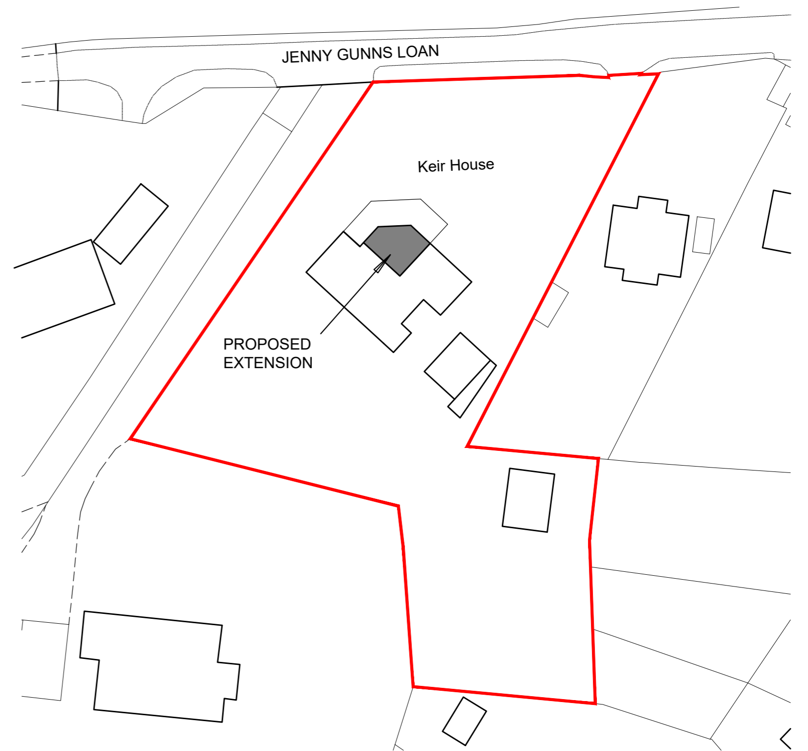
SITE PLAN AS PROPOSED 1:500

Revisions :- A 18.12.23 Alts for Planning.