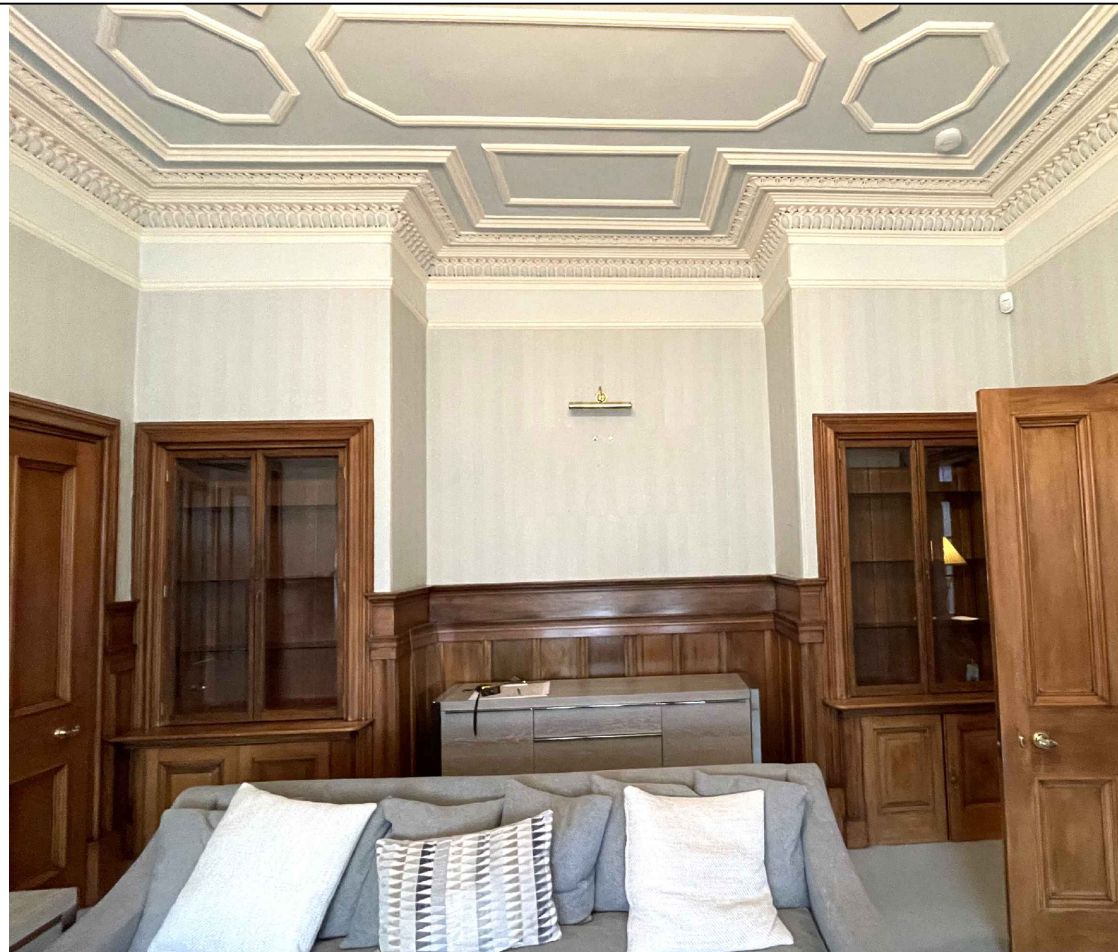
PHOTOGRAPH FROM LIVING ROOM