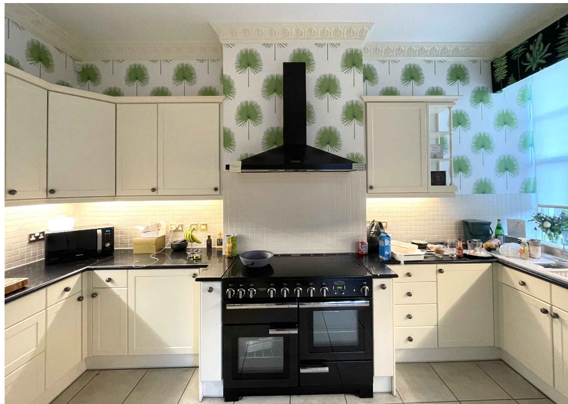
PHOTOGRAPH FROM KITCHEN