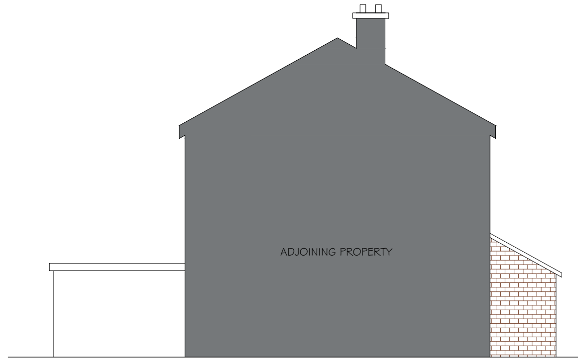
PROPOSED LEFT SIDE ELEVATION SCALE : 1 : 1 0 0