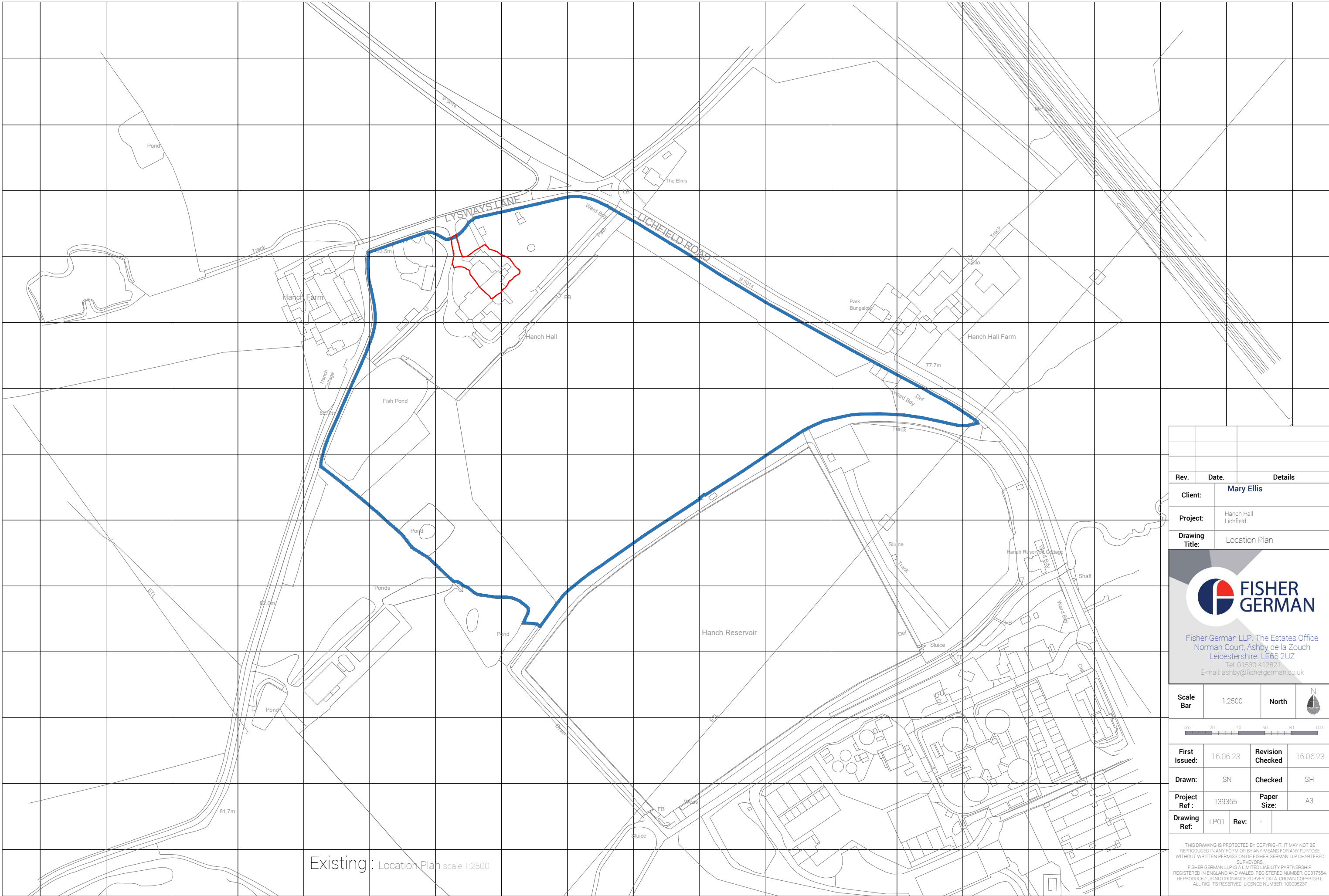
Existing: Location Plan scale 1:2500