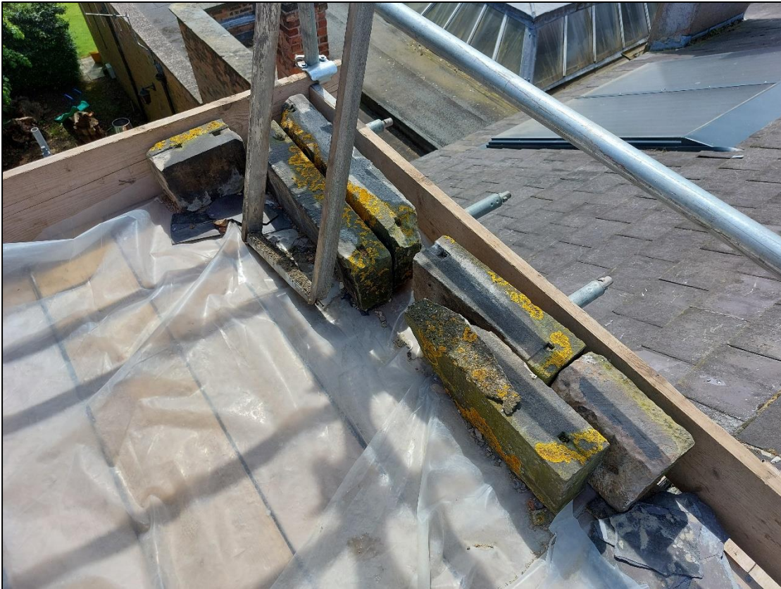
Fig.4 – Stone apex section removed to stack 1 to be reinstated.