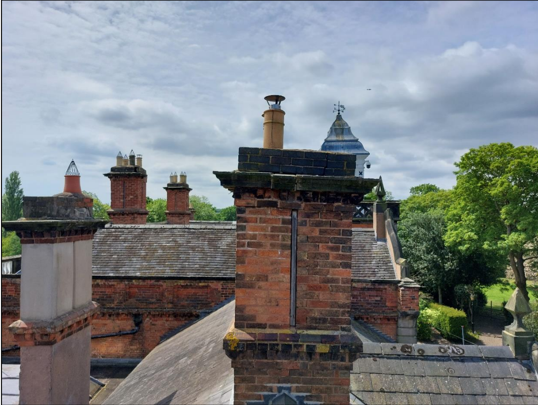
Fig.5 – Stack 2