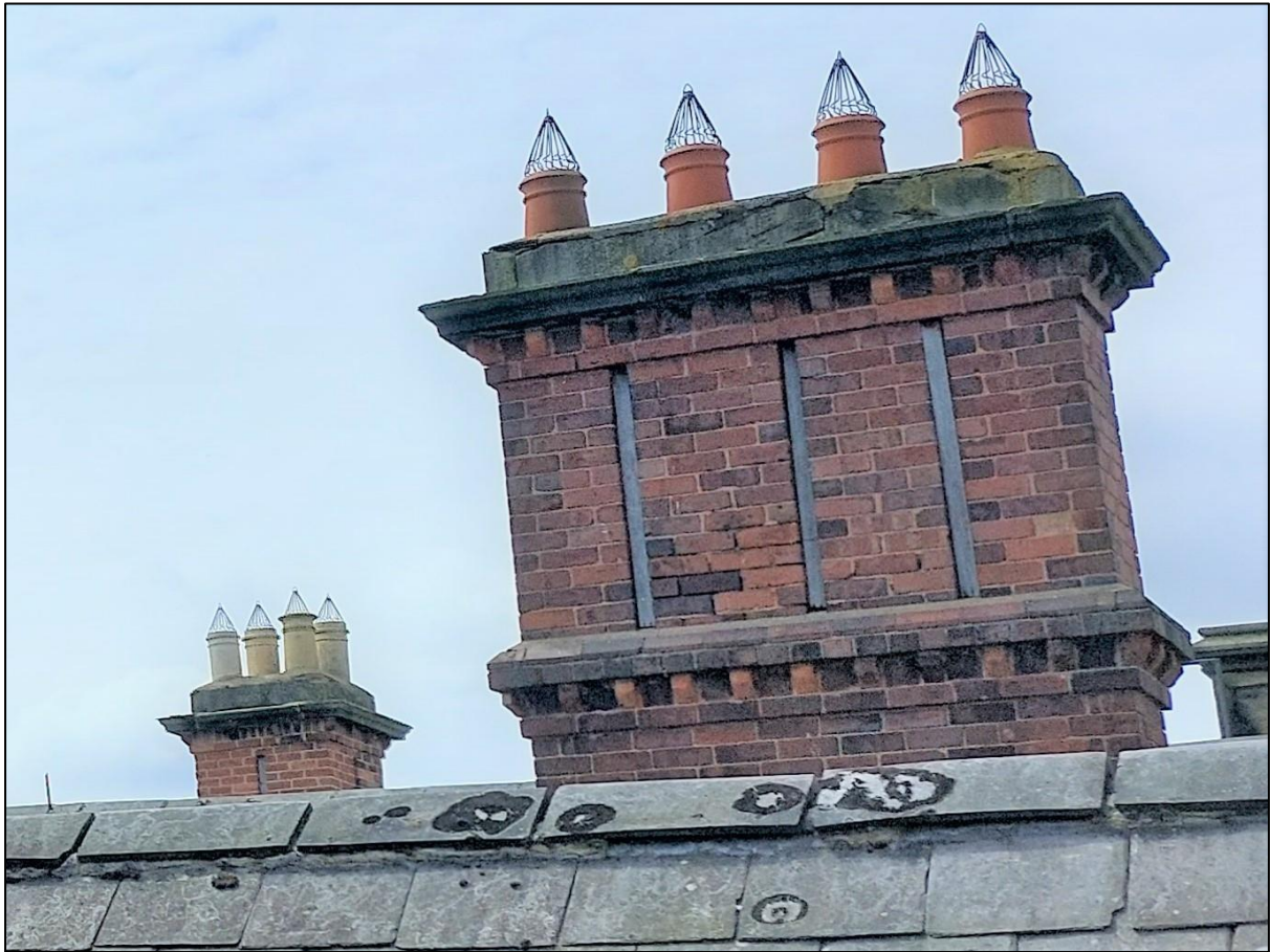
Fig.7 – Typical detail to other Chimney Stacks at Hanch Hall