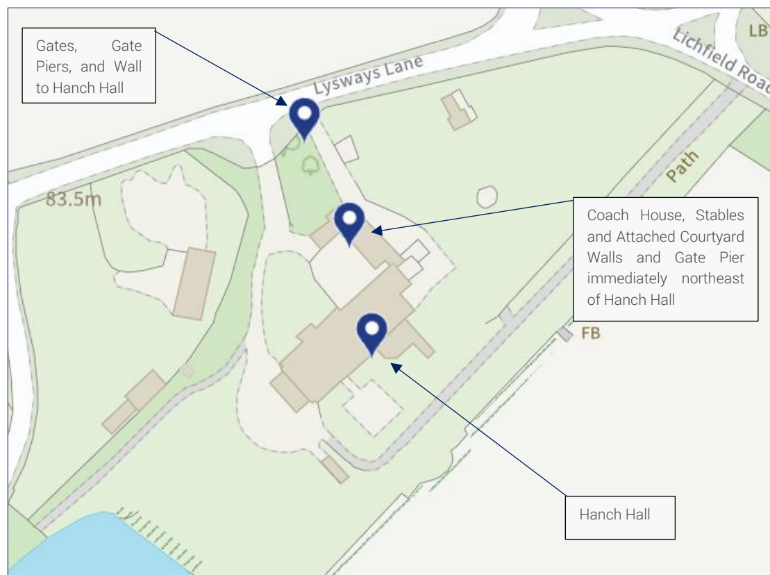
Fig.1 – Heritage Assets at Hanch Hall

The List entries for these assets are shown in the appendix.