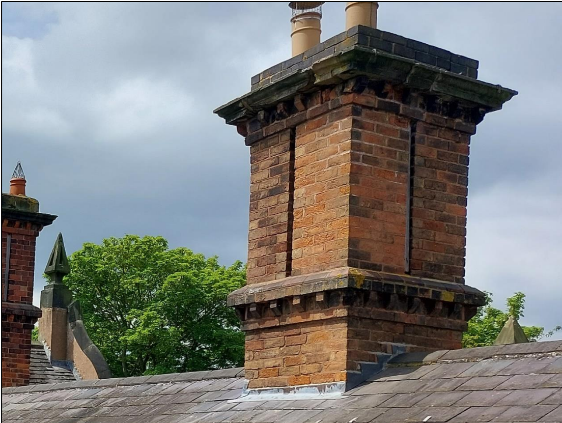
Fig.6 – Stack 2