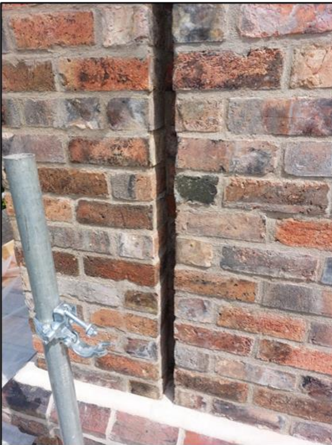
Fig.2 – Stack 1 – Shadow gap created as part of rebuilding works.