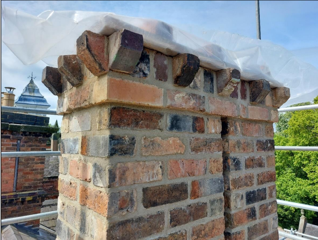
Fig.1 – Stack 1 reconstructed up to stone cornice level.