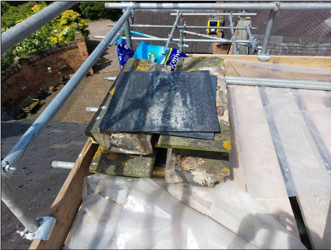
Fig.3 – Stone cornice removed to stack 1 will be reinstated. 1no. new cornice section is required.