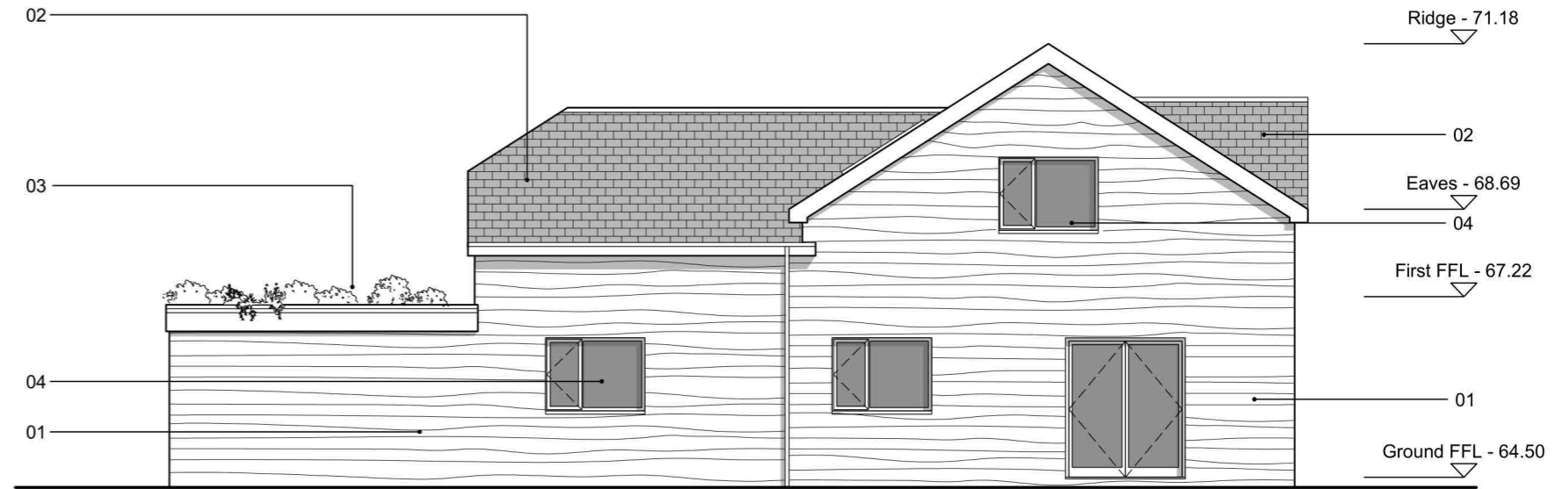
04 Proposed North Elevation 1:100

Proposed Material Key: 01 - Waney Edged Horizontal Larch Cladding 02 - Natural Grey Roof Slates 03 - Sedum Roof 04 - Anthracite Grey Powder Coated Aluminium Windows & Doors