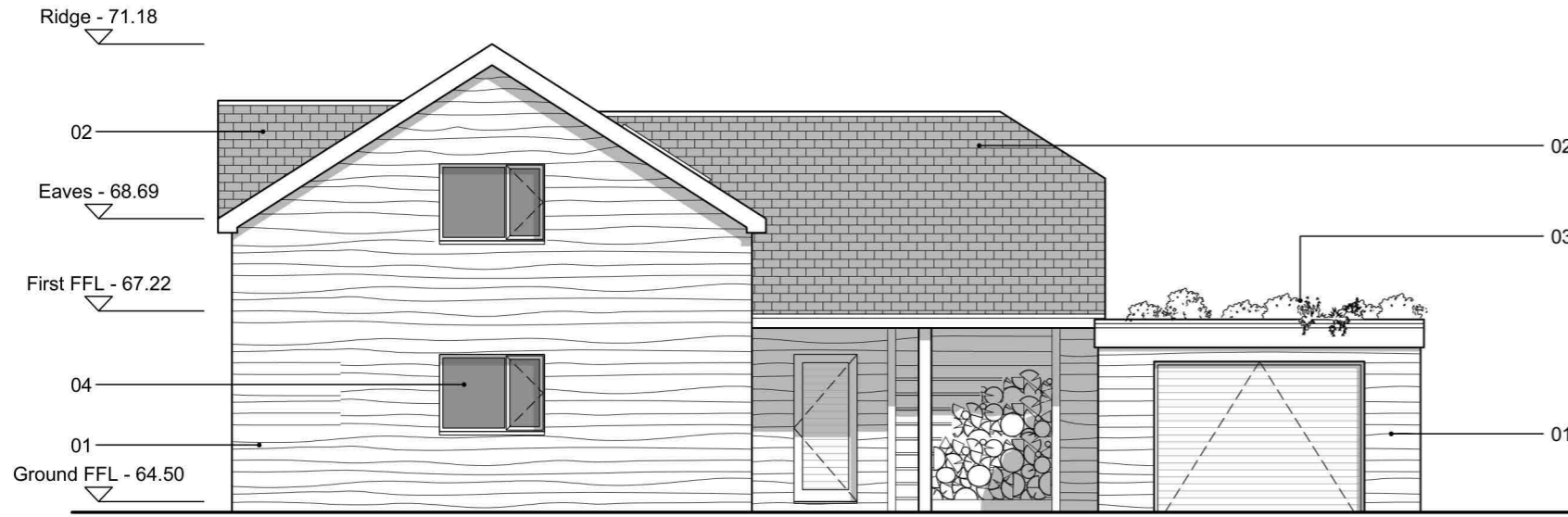
01 Proposed South Elevation 1:100