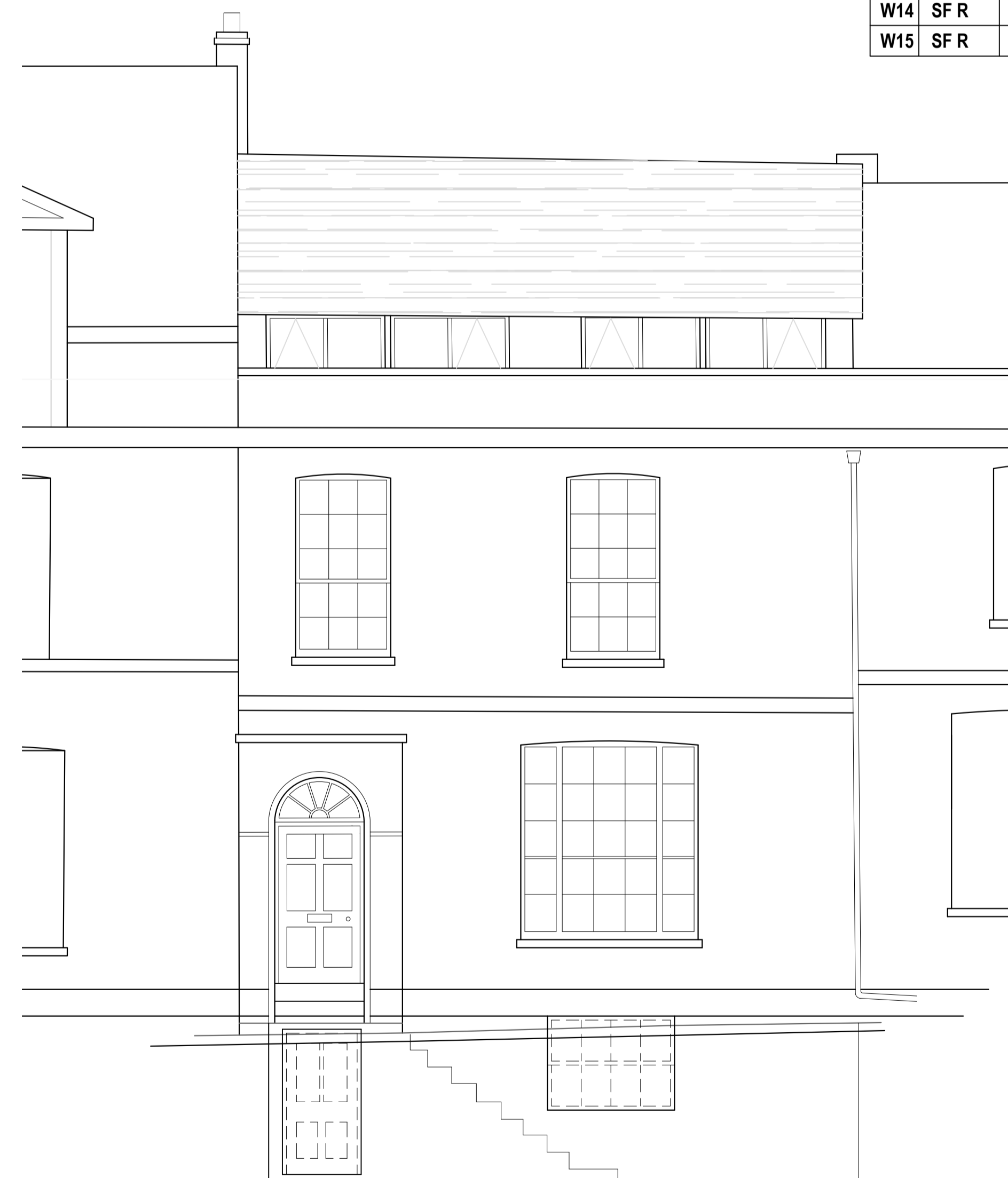
PROPOSED FRONT (NORTH EAST) ELEVATION 1:50

black painted metal railings to boundary wall not shown for clarity; no work / alterations proposed