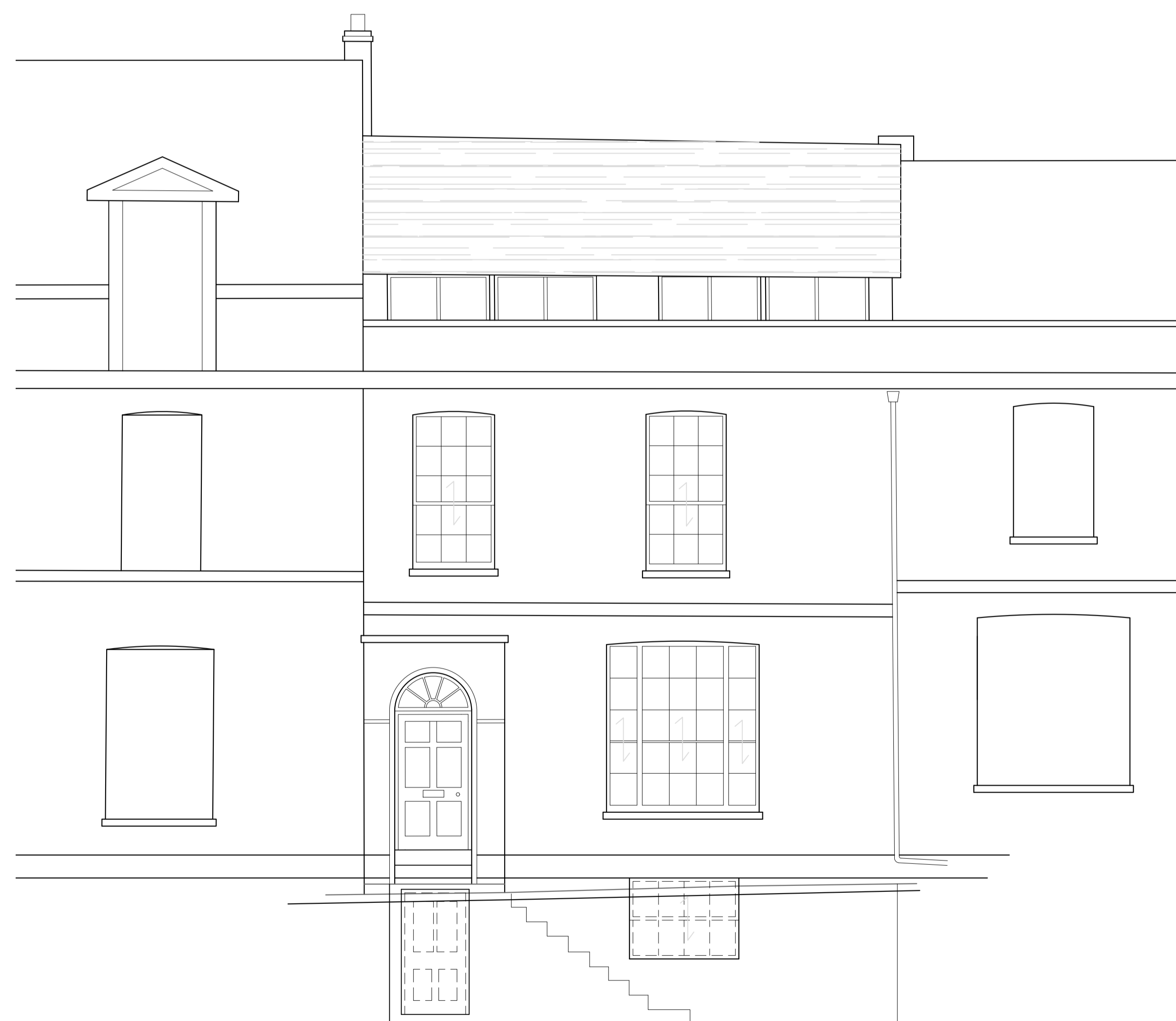
EXISTING FRONT (NORTH EAST) ELEVATION 1:50

black painted metal railings to boundary wall not shown for clarity; no work / alterations proposed