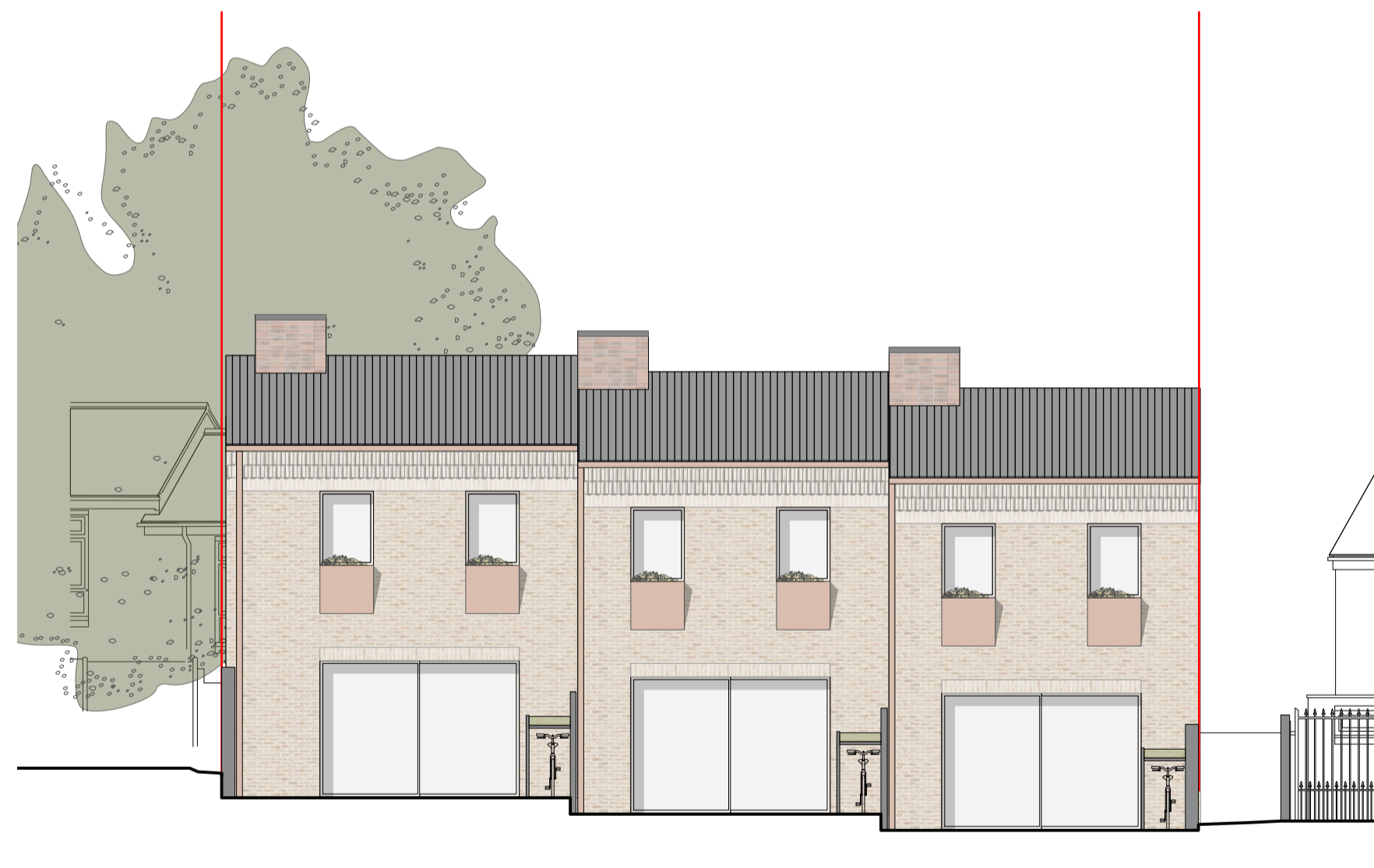
02 Rear Elevation (East) Scale: 1:100