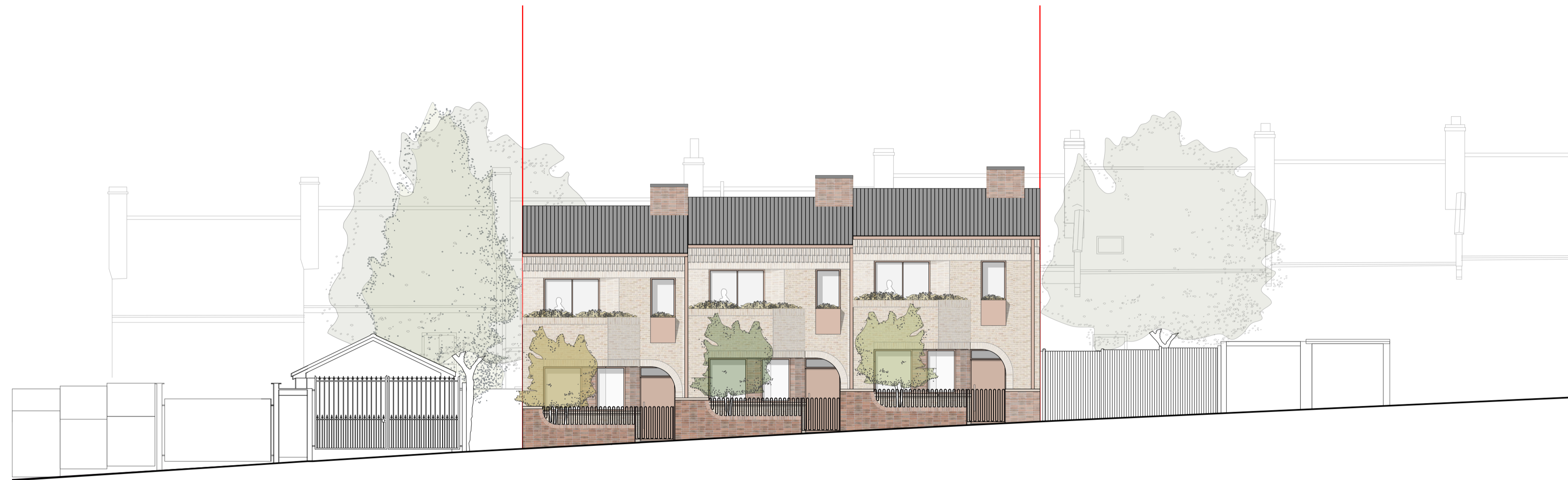
01 Front Elevation (West) Scale: 1:100