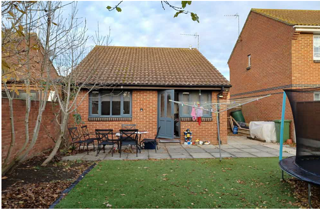
EX REAR ELEVATION NO 12 ROLLESBY WAY