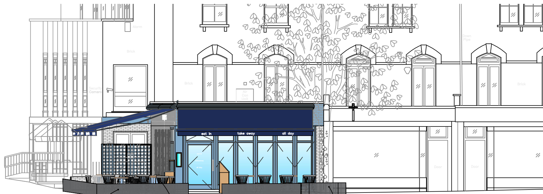
02 Proposed Front Elevation - Awning Out 1:100 @ A3 Datum 25.00m

New planters 200mm wide running along boundary Decking and balustrade removed. Outdoor furniture to be positioned onto new paving from forecourt works