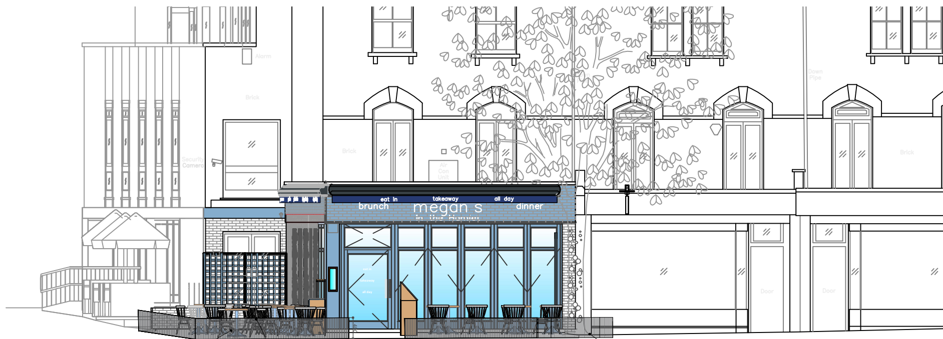
02 Proposed Front Elevation - Awning In 1:100 @ A3

Decking and balustrade removed. Outdoor furniture to be positioned onto new paving from forecourt works