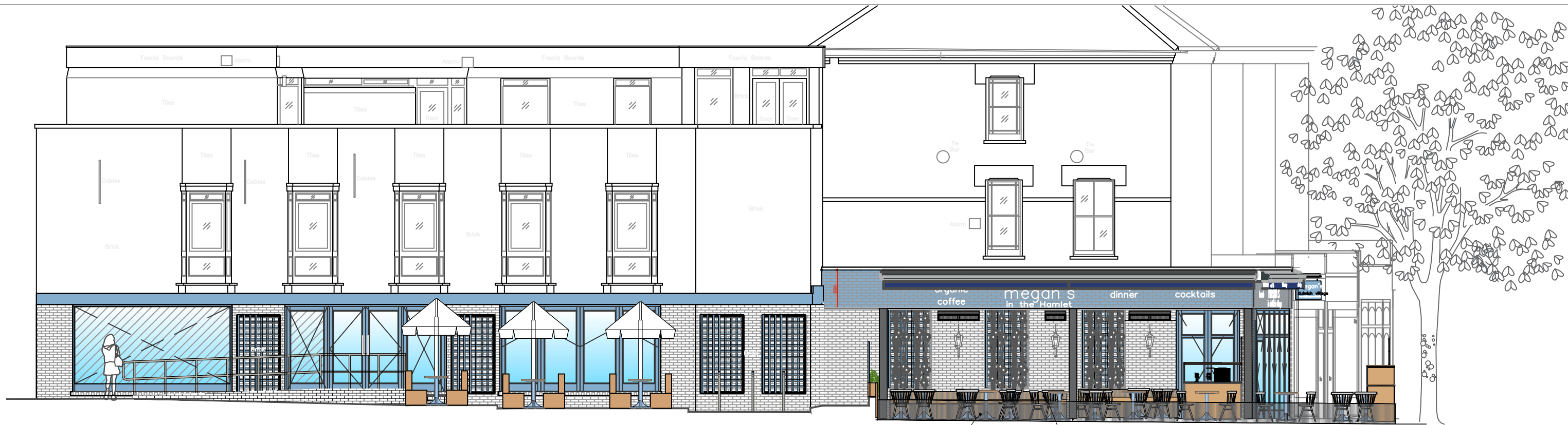
01 Proposed Side Elevation - Awning IN 1:100 @ A3

New planters 200mm wide running along boundary