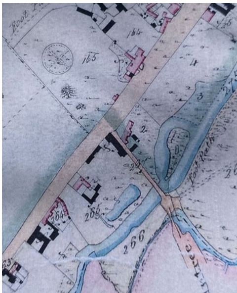
1846 Tithe Map

The proposed site of the greenhouse is to the rear of the building identified in the 1846 Tithe Map (below). It does not impact upon any of the buildings identified on the Tithe Map and is in an area that would typically have been subject to the flooding of the River Stour. It is assessed that the specific area is of no archaeological significance.