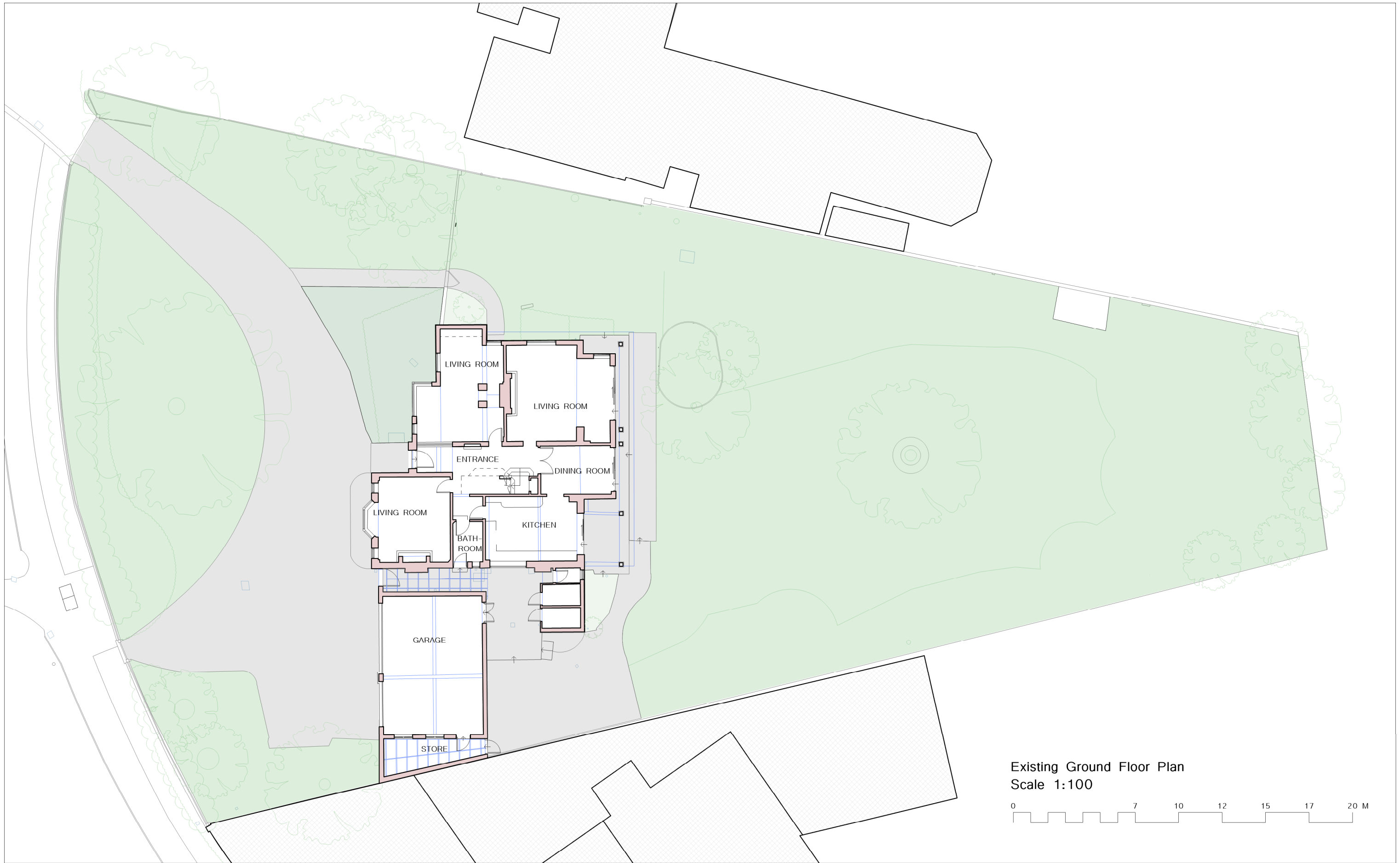
Existing Ground Floor Plan Scale 1:100