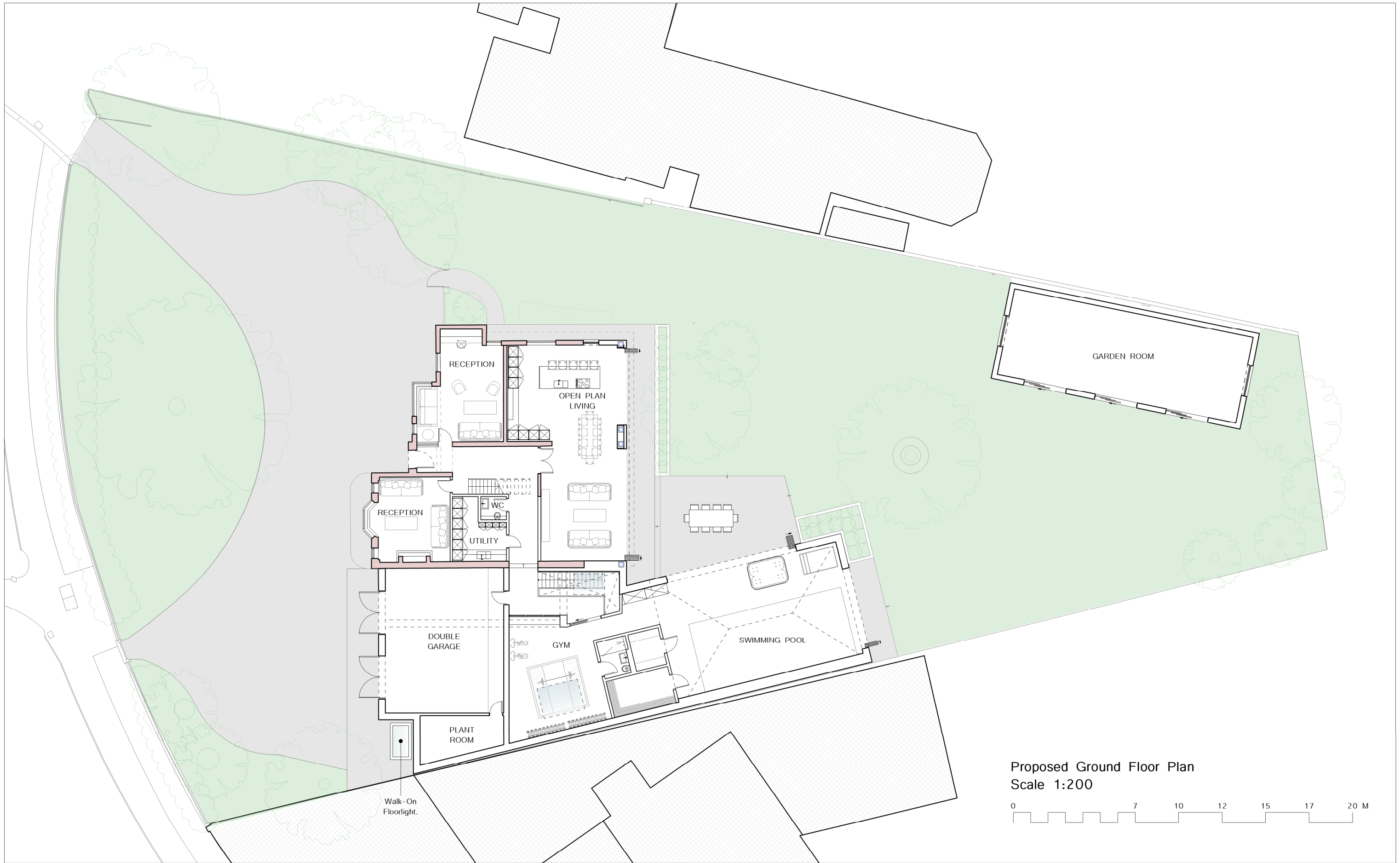
Proposed Ground Floor Plan Scale 1:200