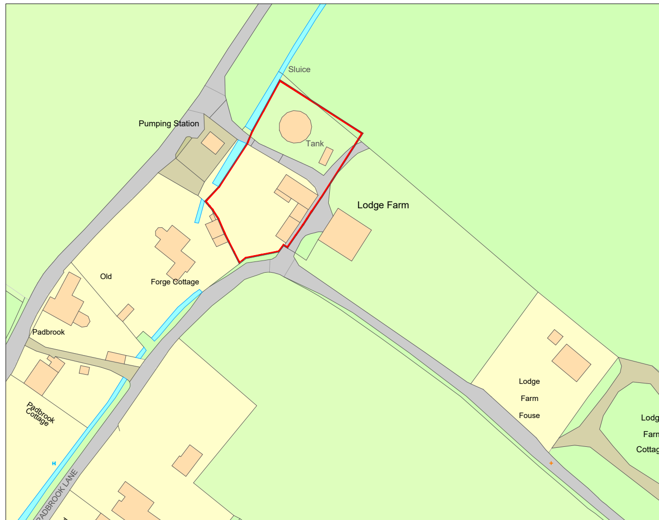
SITE LOCATION PLAN - SCALE 1/1250