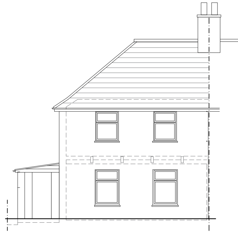
EXISTING SOUTH ELEVATION – FRONT