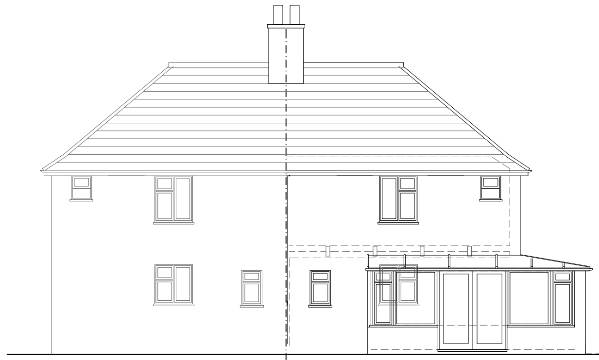
EXISTING NORTH ELEVATION – REAR