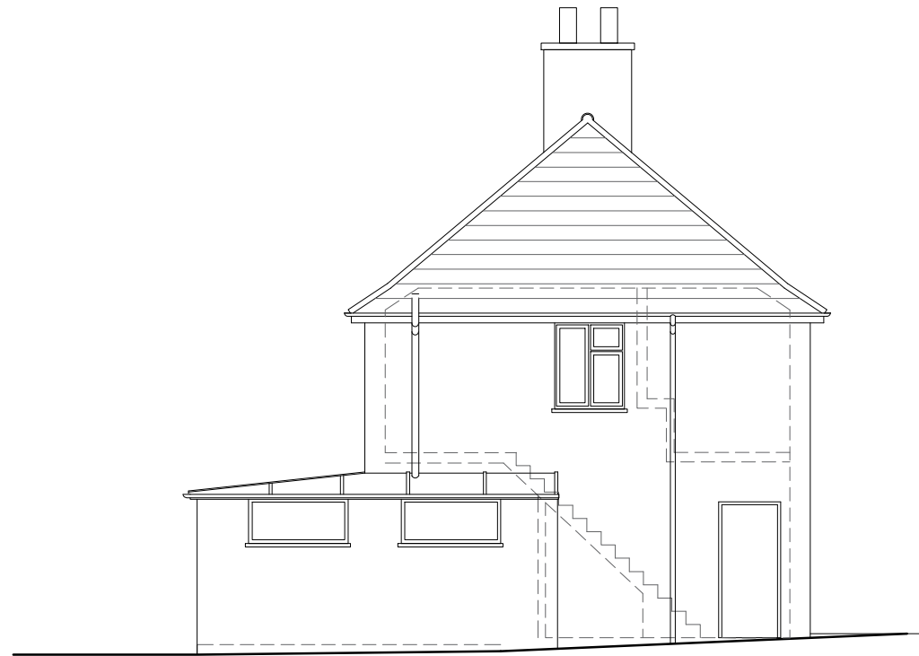
EXISTING WEST ELEVATION – SIDE