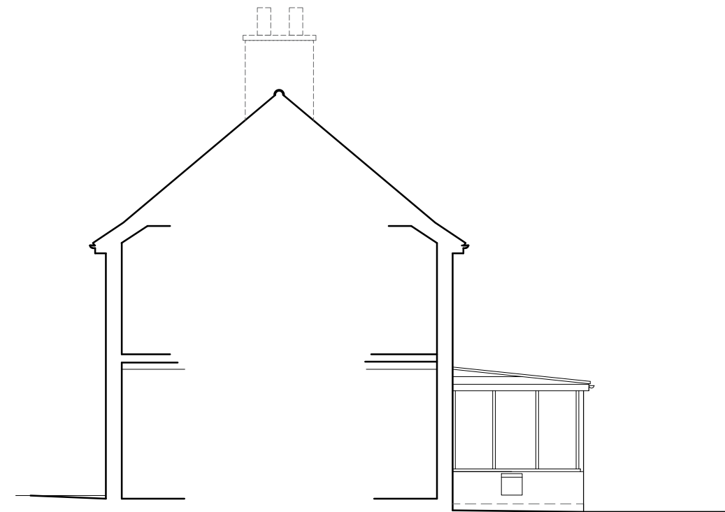
EXISTING EAST ELEVATION – SIDE