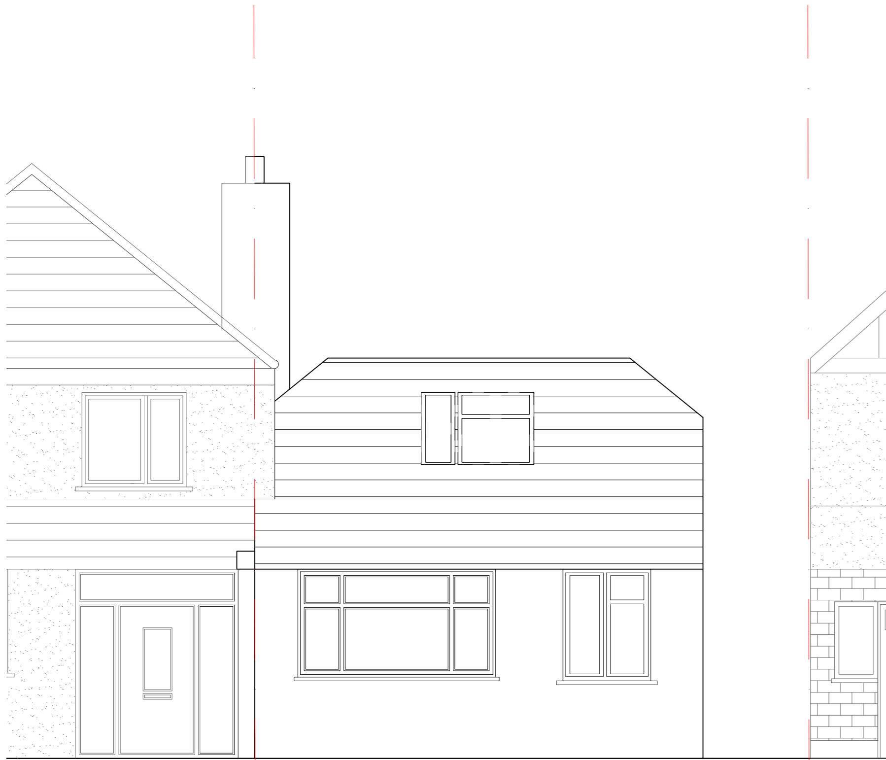
EXISTING FRONT ELEVATION SCALE 1:50@ A2

All Steels Joists etc to be measured from site, do not measure from drawing or calculations, site dimensions to be taken. NKM Studio will not be held responsible for incorrect materials any mistake should be reported to NKM Studio straight away.