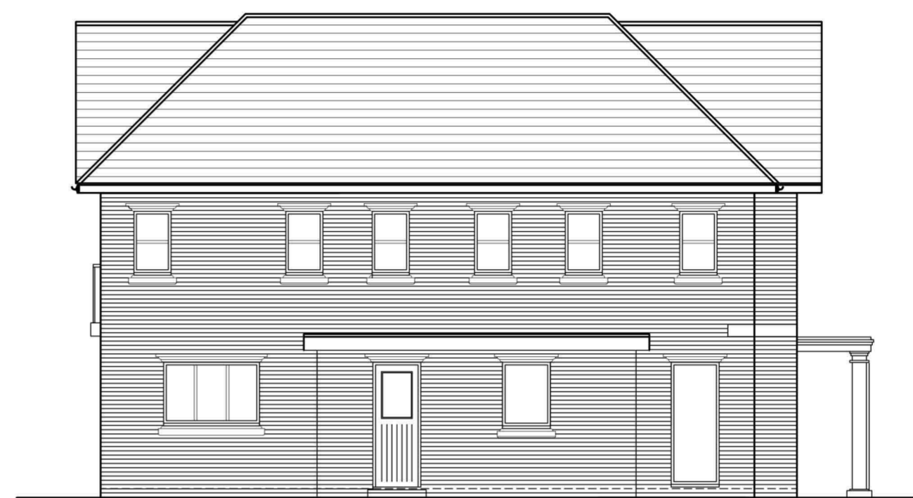
SIDE ELEVATION – EAST