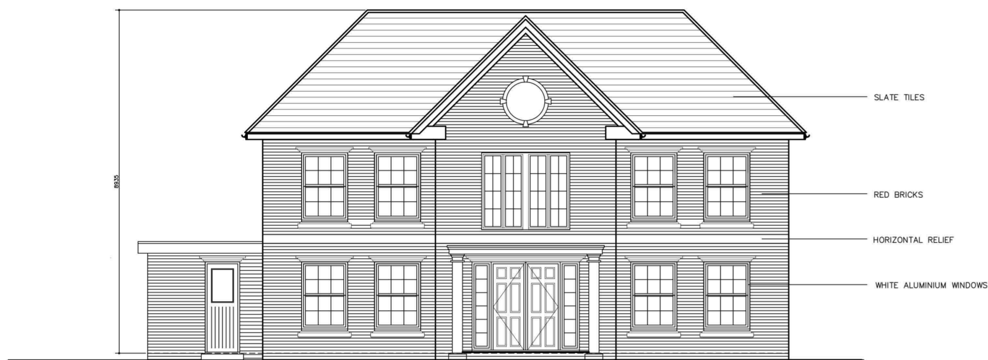
FRONT ELEVATION – NORTH