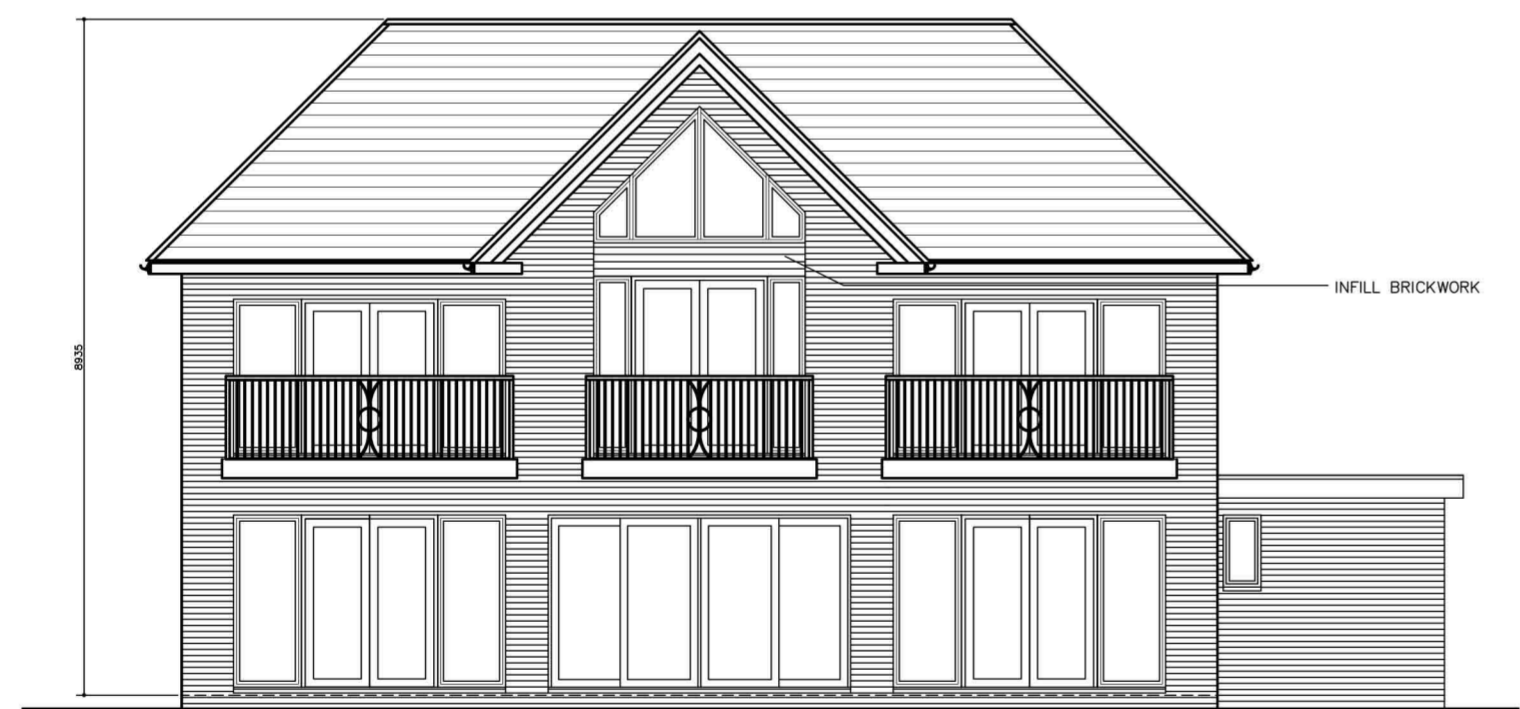
REAR ELEVATION – SOUTH