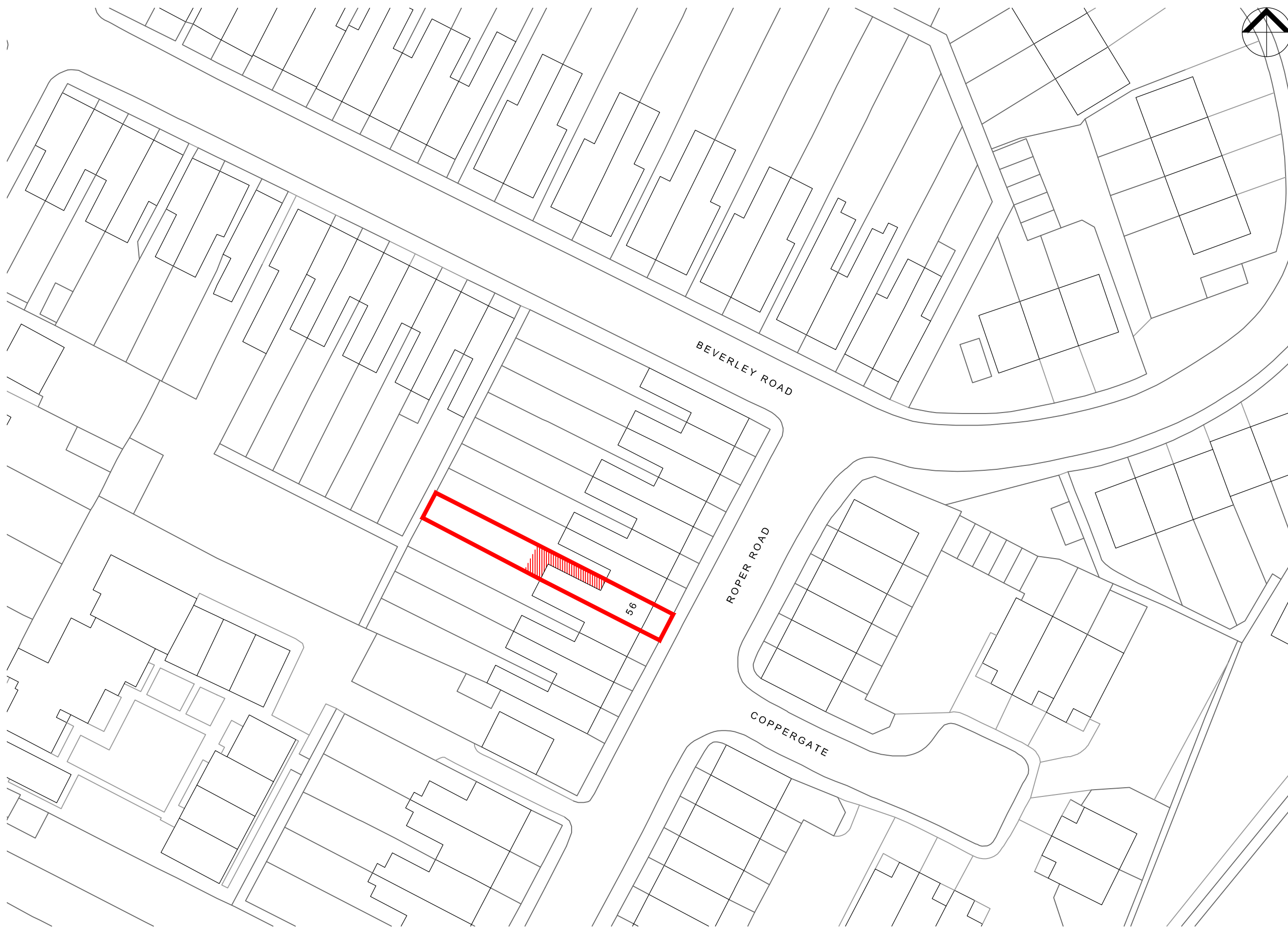
BLOCK PLAN Scale 1:500 @ A3