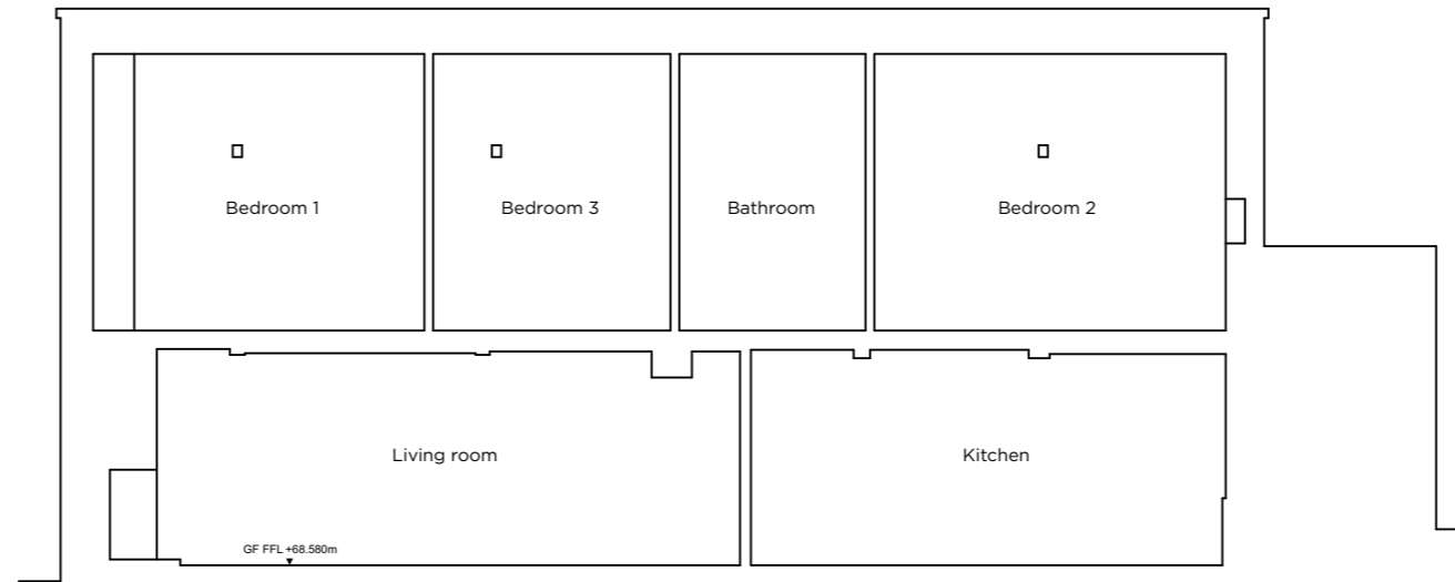
02 Existing Cottage Section B-B 1:100