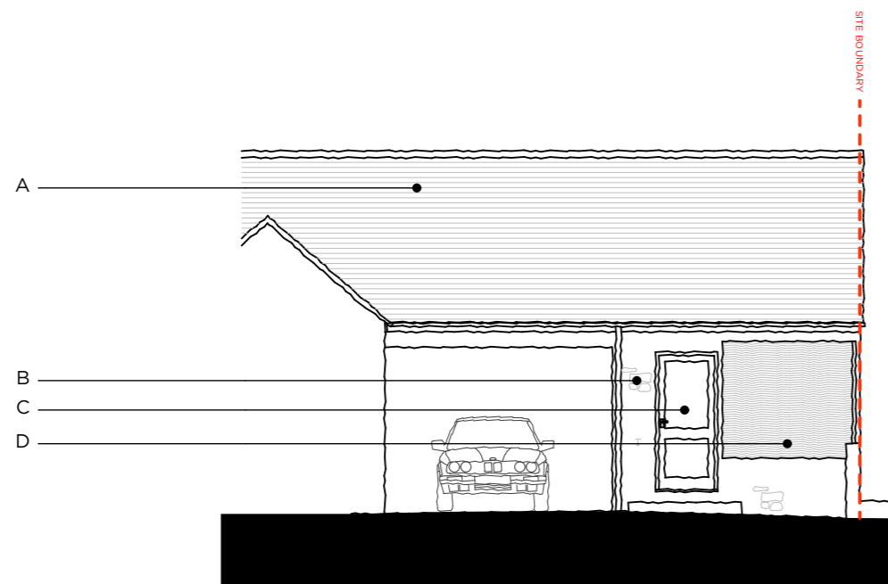
E4 Existing East Carport Elevation 1:100