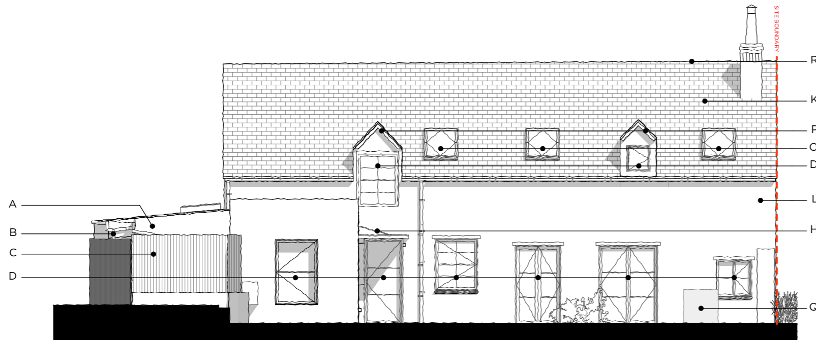
E1 Proposed West Elevation 1:100