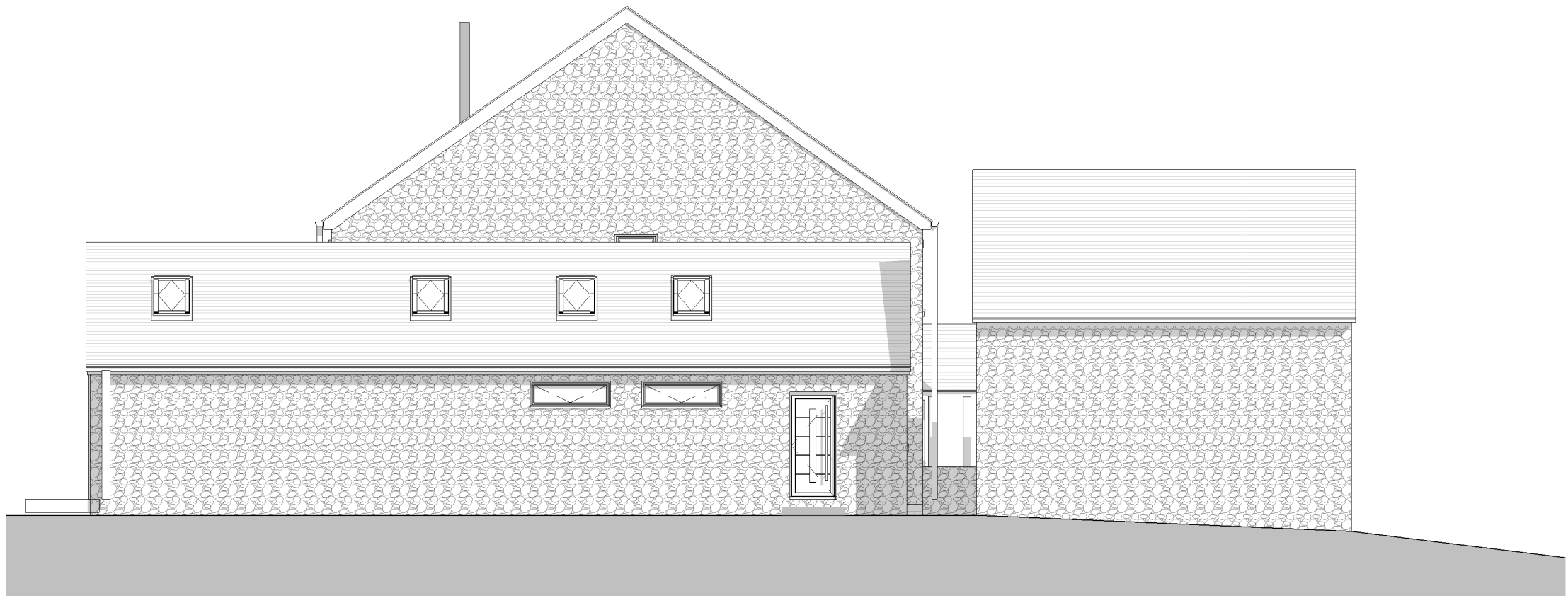
Proposed East 1 : 100