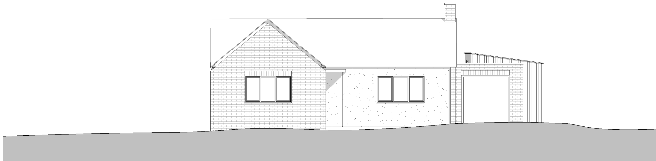
Existing North 1 : 100