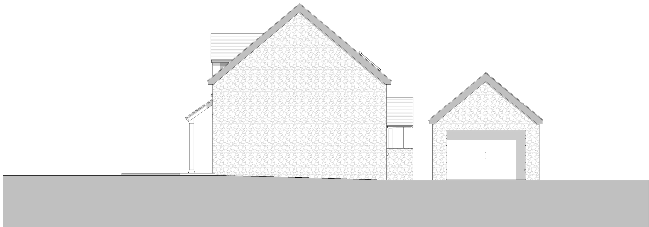
East Elevation 1 : 100