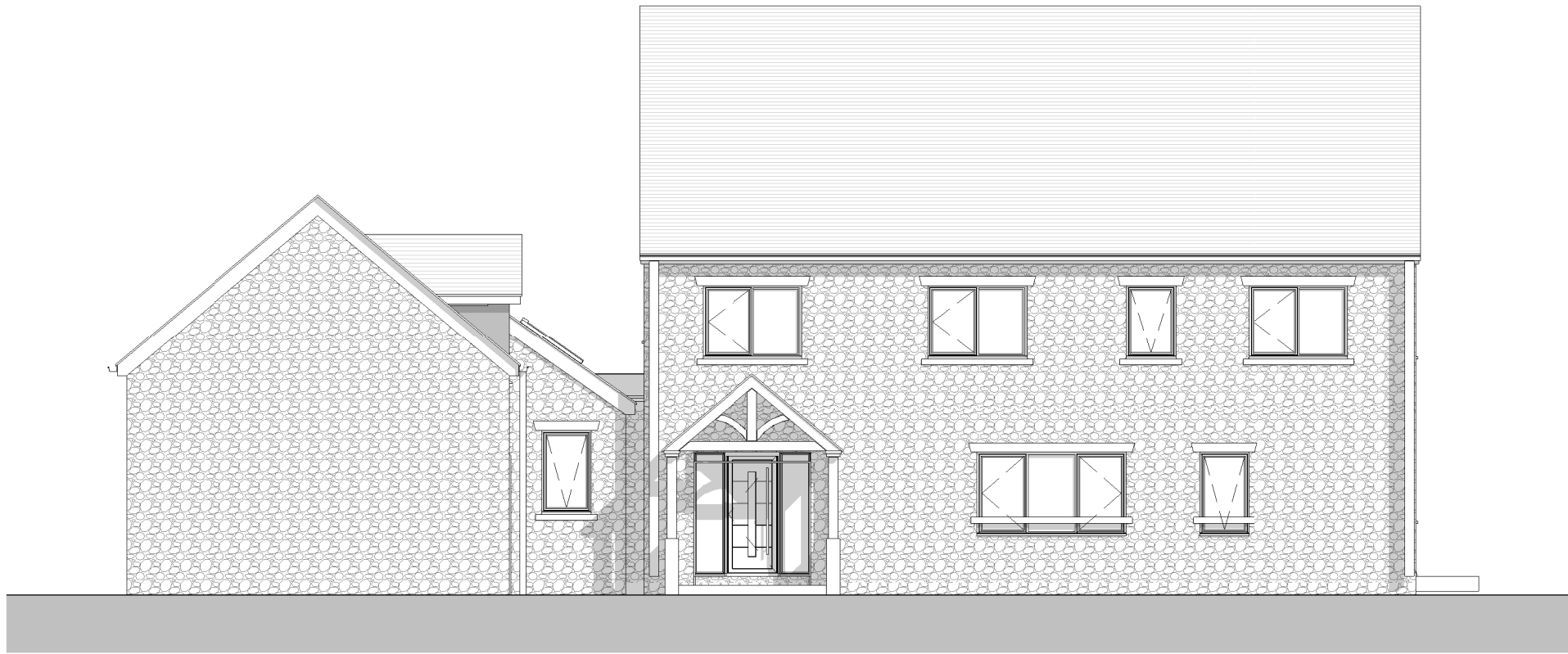
Proposed North 1 : 100