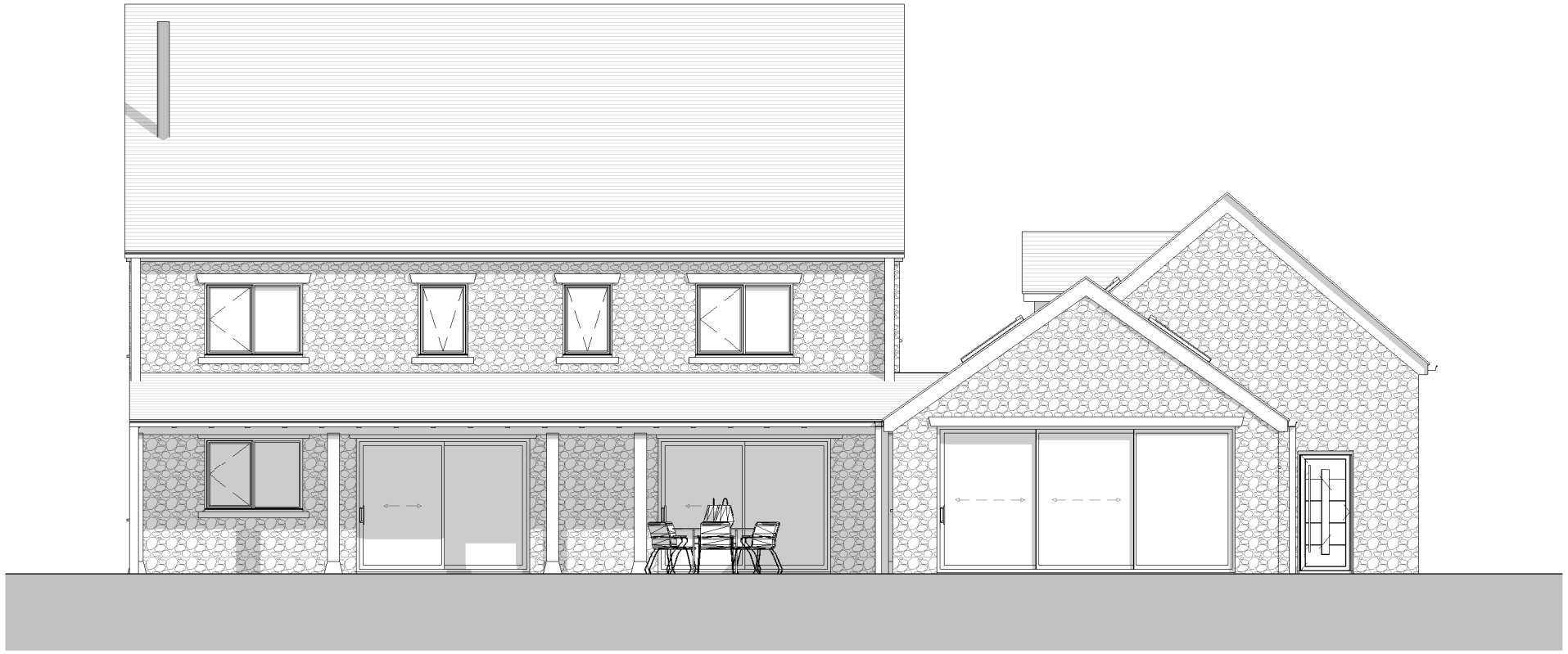
Proposed South 1 : 100