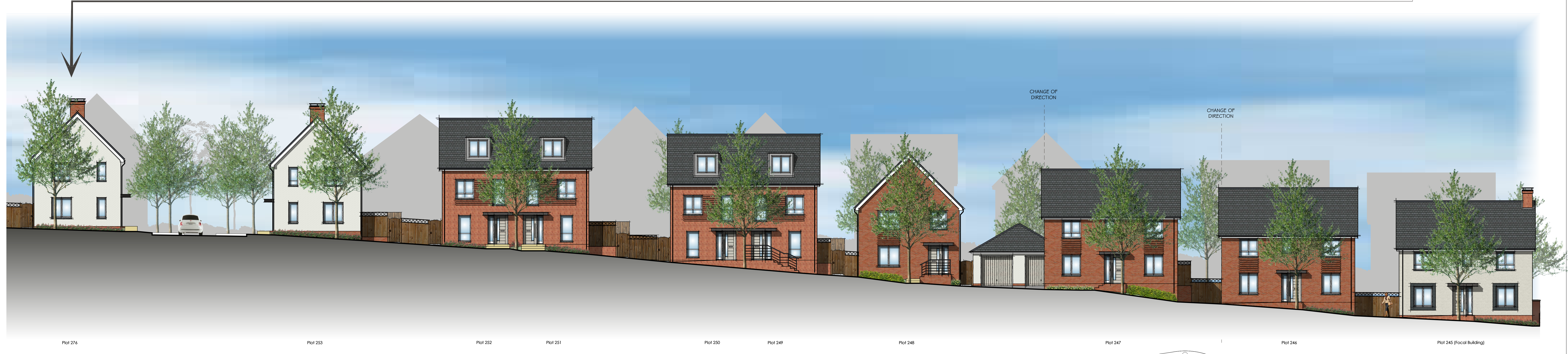
STREET SCENE C-C (Part 1) Central Slopes (Non Key-frontage) 1:100

Plot 276 Plot 253 Plot 252 Plot 251 Plot 250 Plot 249 Plot 248 Plot 247 Plot 246 Plot 245 (Focal Building)