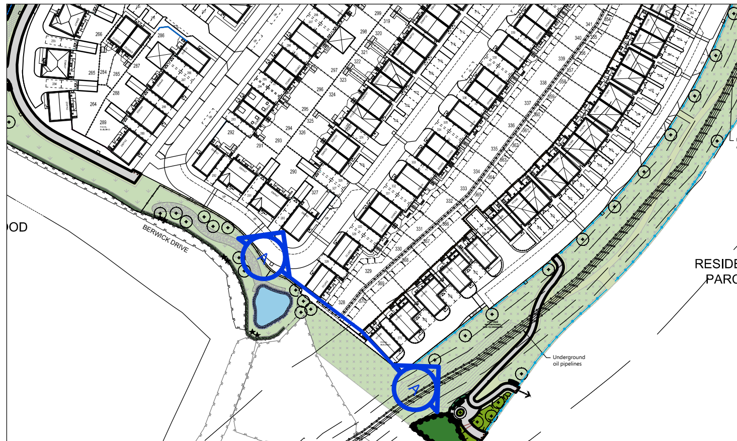
Site Layout Extract