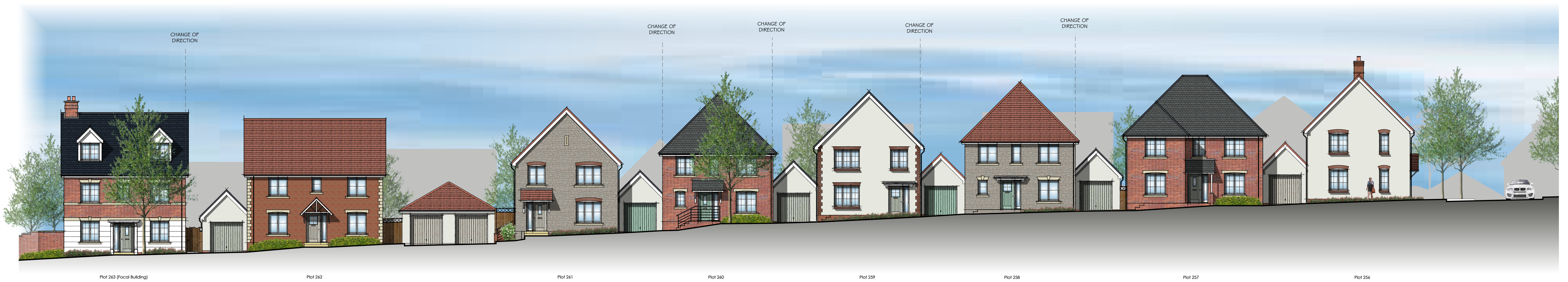
STREET SCENE B-B (Part 1) Woodland Ridge 1:100