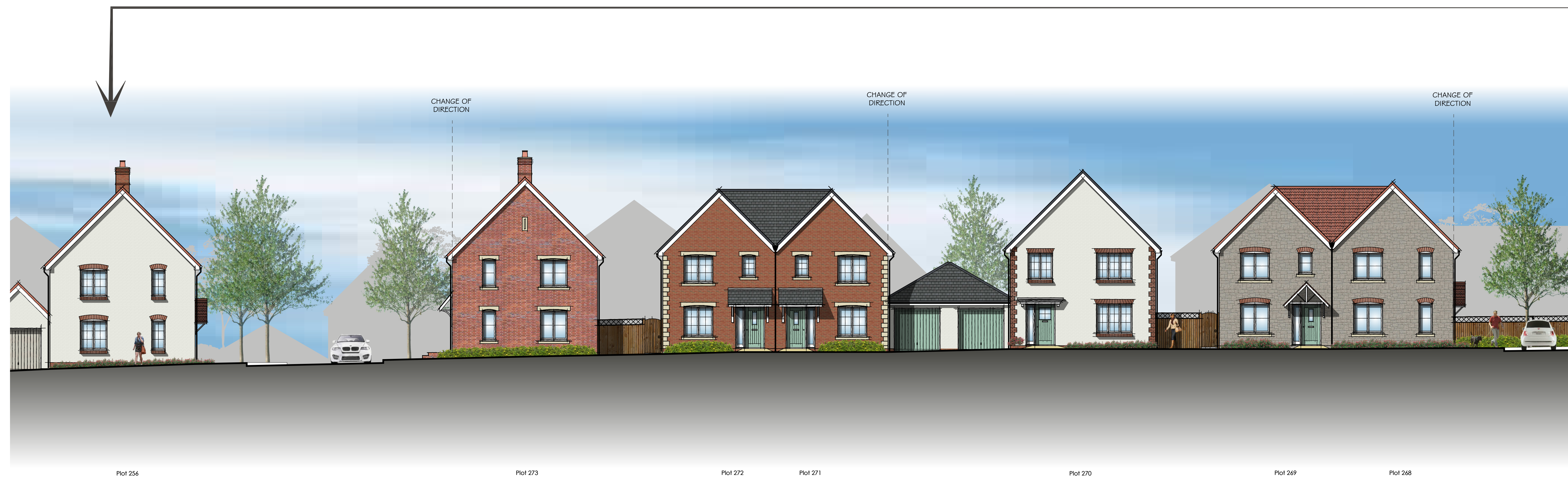
STREET SCENE B-B (Part 2) Woodland Ridge 1:100