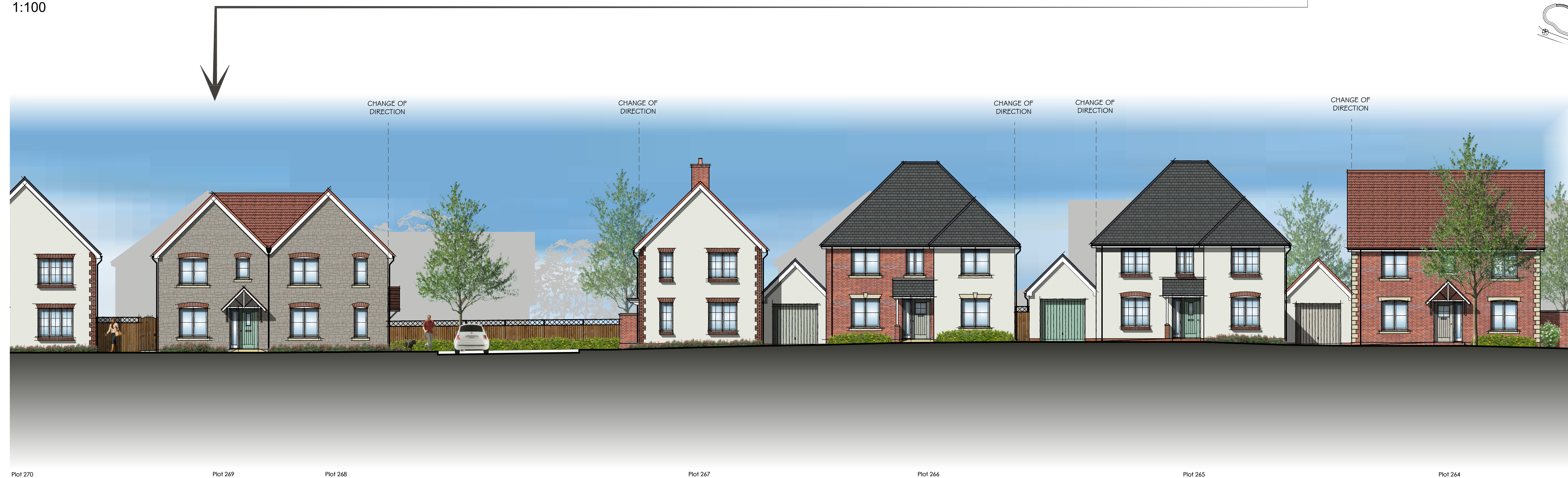
STREET SCENE B-B (Part 3) Woodland Ridge 1:100