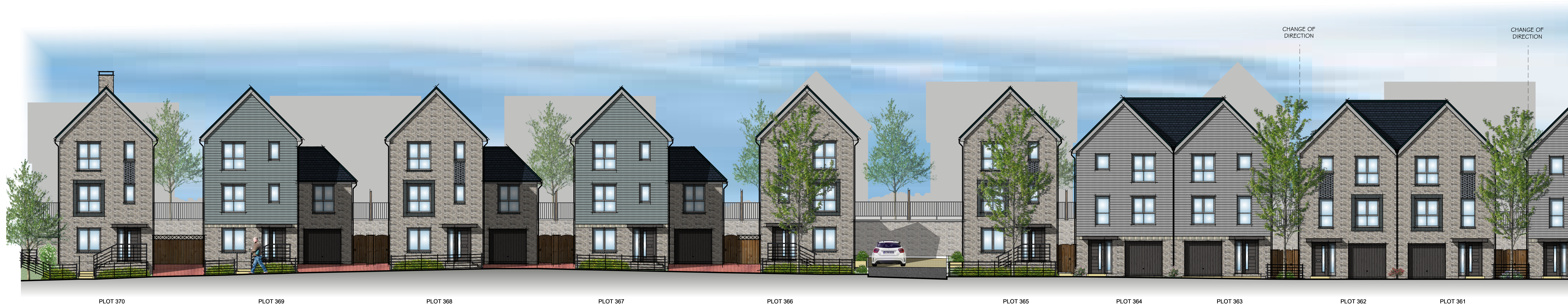
STREET SCENE A-A (Part 1) Central Slopes (Key-frontage) 1:100