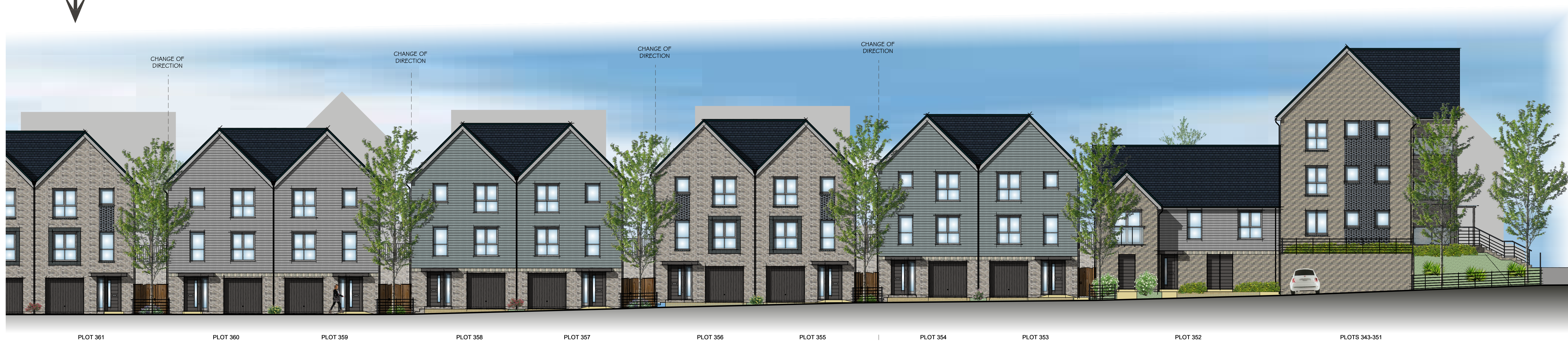
STREET SCENE A-A (Part 2) Central Slopes (Key-frontage) 1:100