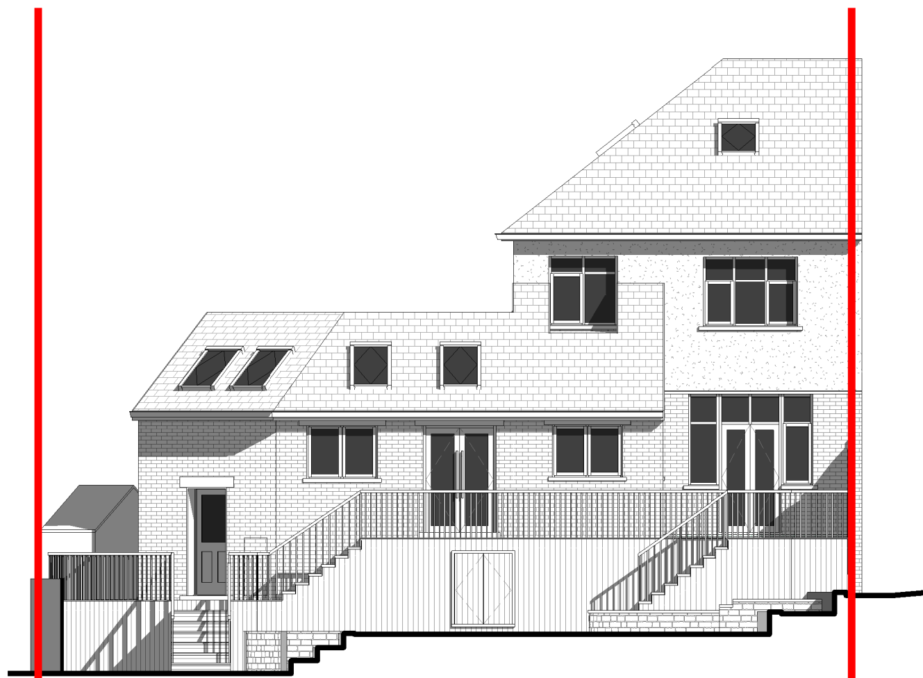
Elevation 04 - Existing West Elevation